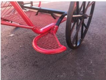
Axel invertible, to take up to 50" Wheels