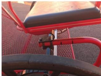
Springs on axel and on seat