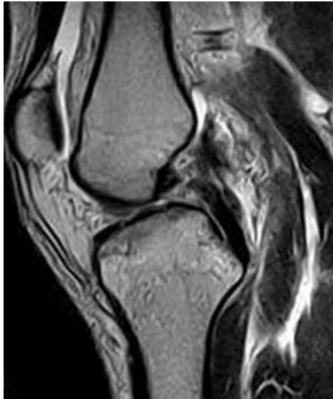
Figure 6: Sagittal MRI image shows a complete tear in the posterior cruciate ligament. Discontinuity of the fibers.