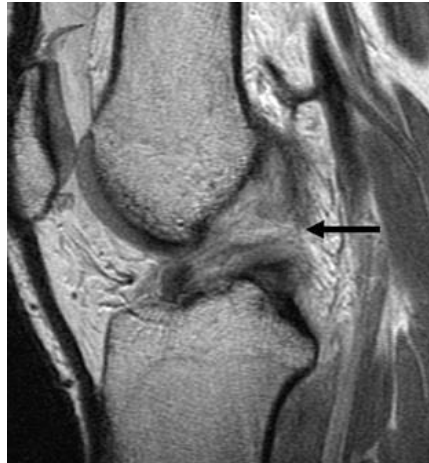
Figure 3: Sagittal MRI image shows an acute complete tear in the anterior cruciate ligament. High signal with discontinuity of the fibers (black arrow).