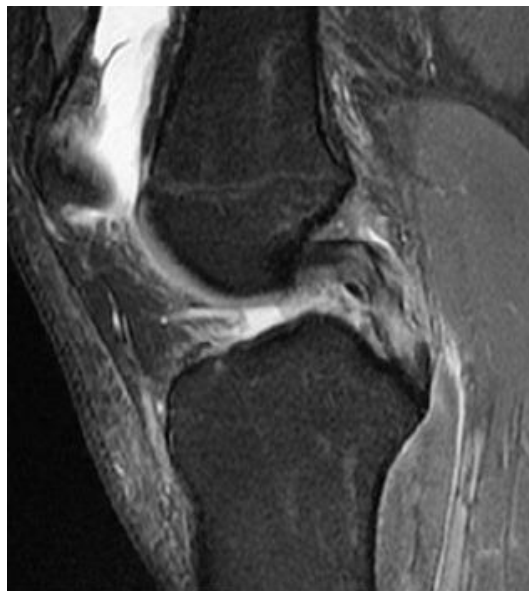
Figure 7: Sagittal MRI image shows a partial tear in the posterior cruciate ligament. Thickening and high signal with continuity of the fibers.