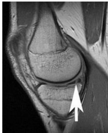
Figure 2: Sagittal MRI image shows a vertical tear in the posterior horn of the medial meniscus (white arrow).