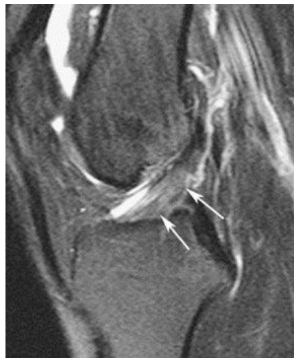
Figure 4: Sagittal MRI image shows a partial tear in the anterior cruciate ligament. High signal in the distal segment of the ligament with continuity of the fibers (white arrows).