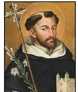
Feast Day: August 8

Readings for Next Sunday, August 11, 2024 1 Kings 19:4-8 Ephesians 4:30-5:2 John 6:41-51