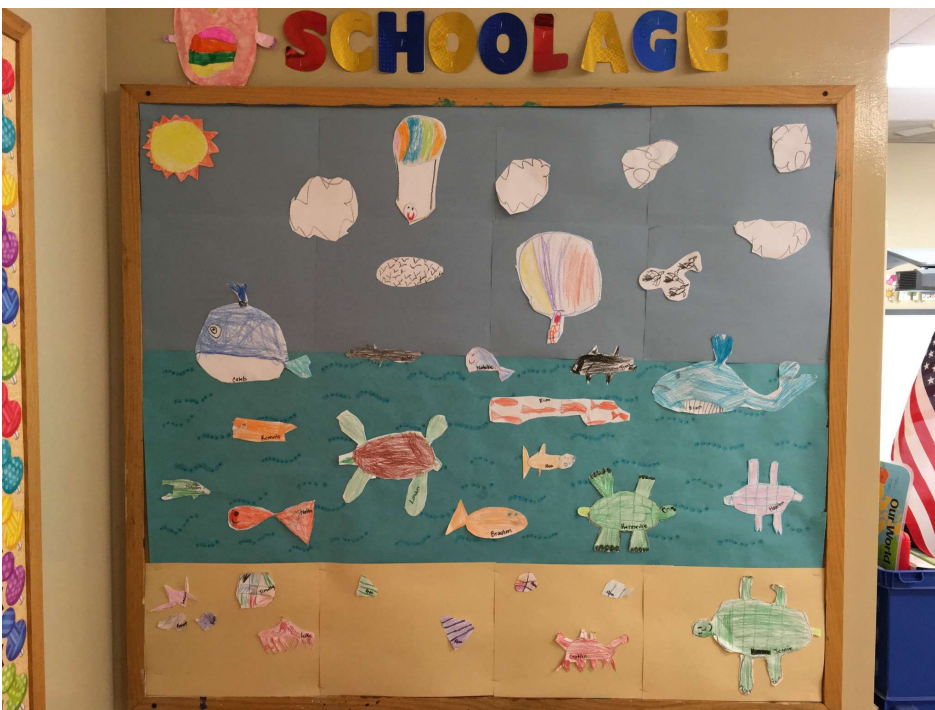
Figure 3: Our schoolagers showing off their oceanic artistic abilities!!