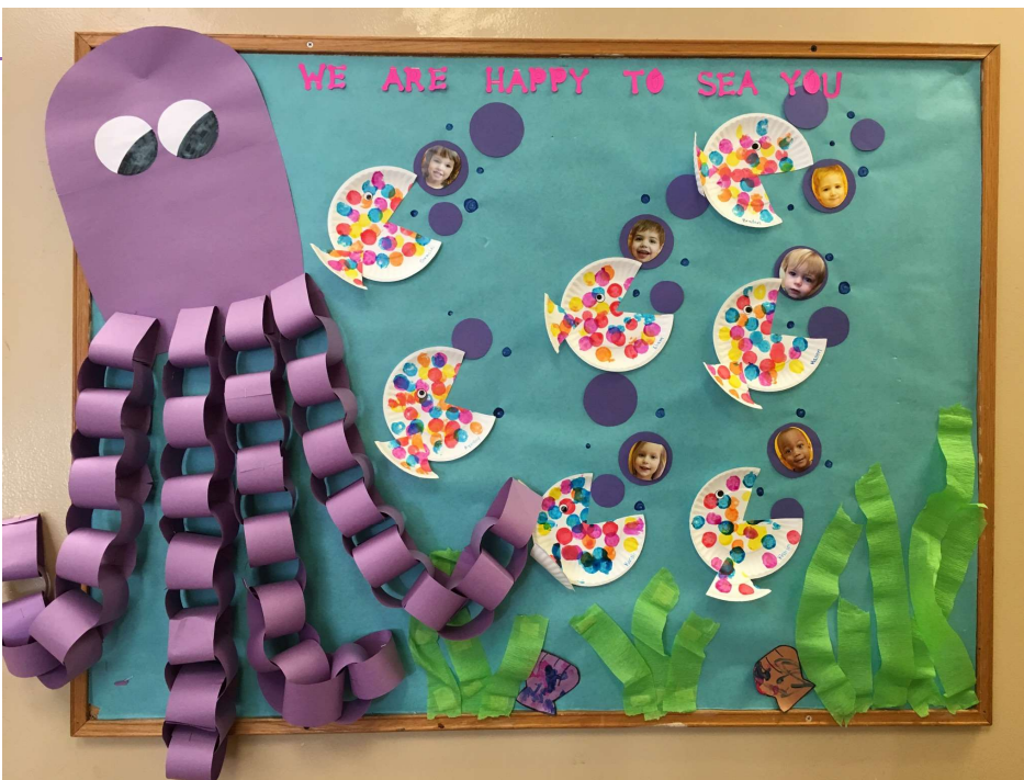
Figure 1: We sure are happy to see the toddlers/2's every day!!

As always, the staff at Beginning Visions appreciate the sacrifices you as parents make for your children and want you to know it does not go unnoticed. Thank you for giving us the opportunity to make a positive difference in the life of your children. We will continue to our best in supporting and caring for your children while here at Beginning Visions.