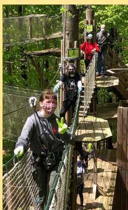
The crew crosses a rope bridge obstacle at Go Ape.

We left the local area for our campout in April and headed up to northern Maryland and Pennsylvania for a short hike along the Appalachian Trail to the Weverton Cliffs overlook,