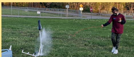
Skye pulls the pin to launch her award-winning soda bottle rocket.

With public health conditions improving, the Venturing crew returned (again) to meeting in person. While our winter sports campouts fizzled due to a key ingredient, snow, being missing, we have gotten back outdoors for fun! In March, we conducted a wilderness survival-themed campout at Summerseat Farms. In addition to building shelters and practicing fire building, we got a search and rescue dog demonstration by the Calvert K-9 Search Team. We got to meet three of the dogs and two of their handlers and learn how they would work together to find us if we should ever find ourselves lost or stranded. The dogs were definitely high energy and LOVE to play with their toys, which are also their rewards during training.