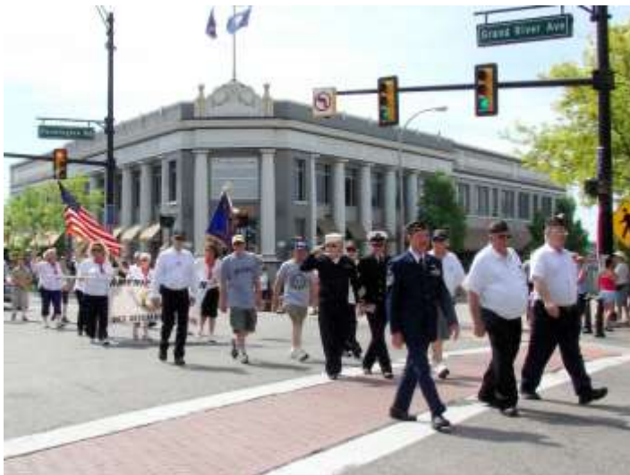
Legionnaires and Auxiliary members march with pride.