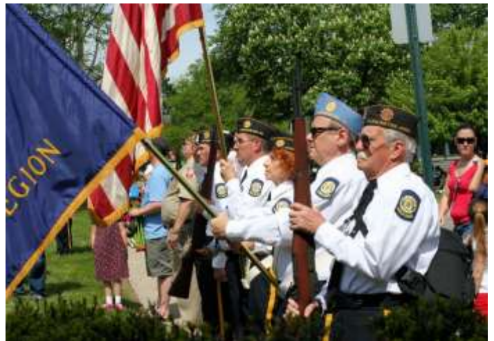
The Post 346 Honor Guard looked sharp at the Memorial Day ceremony and while leading the Memorial Day Parade.