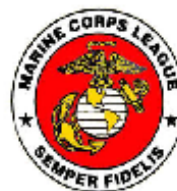
PHOTO RELEASE FORM

I hereby assign and grant to the Marine Corps League and the Scouts of America the right and permission to use and publish the photographs made of me this date by the Marine Corps League and/or the Scouts of America, and I hereby release the Marine Corps League and the Scouts of America from any and all liability from such use and publication, whether online or in print.