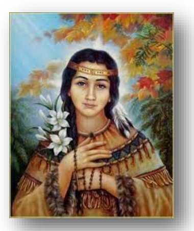
Feast Day: July 14

Readings for Sunday, July 18, 2021 Jeremiah 23:1-6 Ephesians 2:13-18 Mark 6:30-34