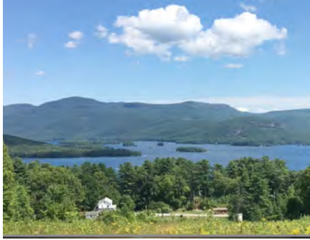
Up Yonda Farm Environmental Education Center

The Lake George Land Conservancy (LGLC) is partnering with Up Yonda Farm Environmental Education Center to offer guided explorations of some of LGLC's favorite preserves.