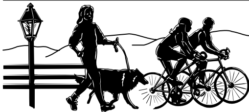
Amana Colonies Recreational Trail