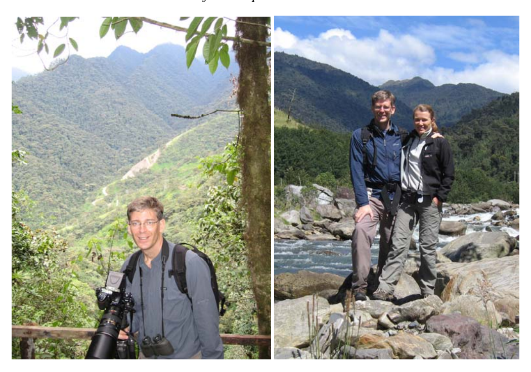
At Tandayapa and Guango