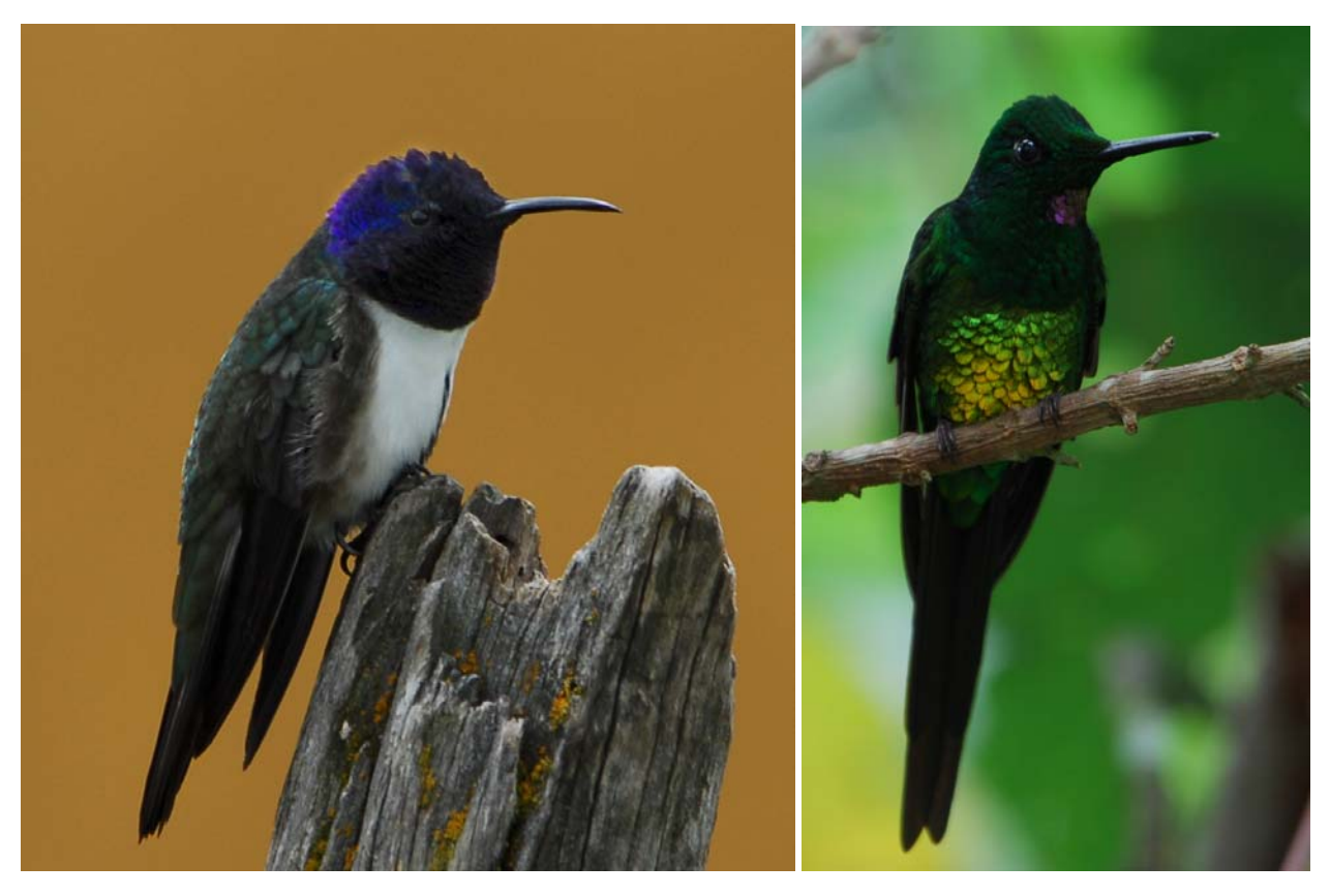
Ecuadorian Hillstar; Empress Brilliant

After a night in Quito we headed off early towards the Antisana volcano and the páramo at 3,500 to 4,000m altitude some two hours drive east of the city. The weather was cooperative and we saw a soaring Condor, spectacular, tiny Ecuadorian Hillstars, Andean Gulls (that live on lakes in the high Andes, not on the coast) and a host of other high altitude species. All set against the dramatic, snow capped volcanoes.