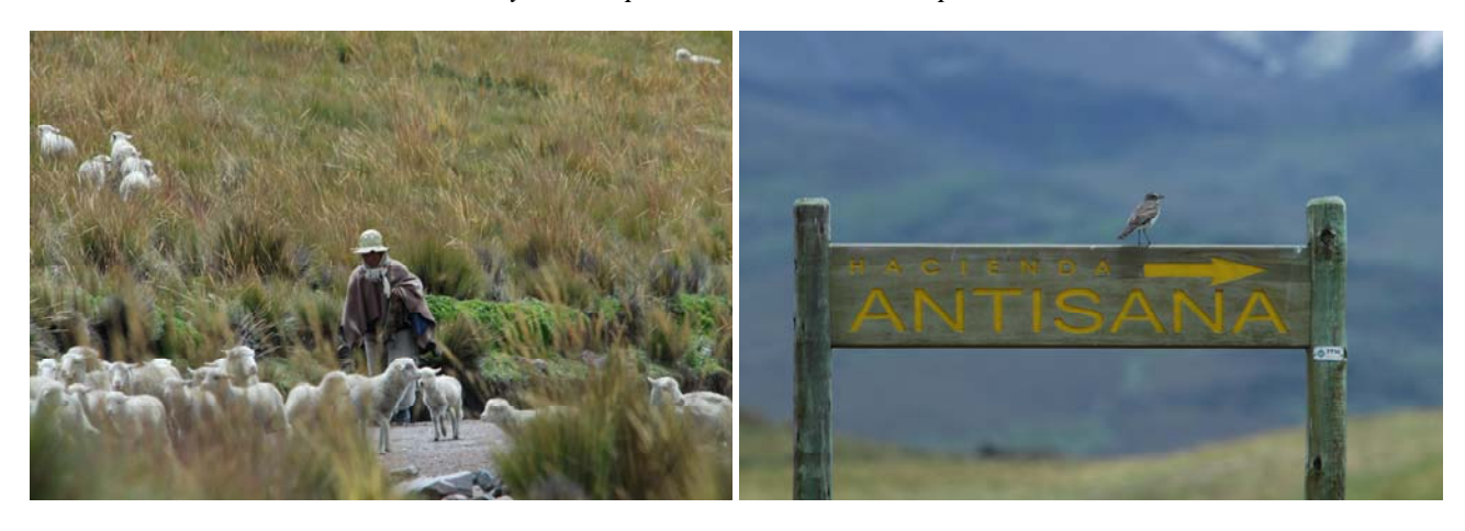
Views at ca. 3,800m on the slopes of Antisana

From Antisana at ca. 4,000m we headed back down towards Quito and then climbed again up the Papallacta valley and across the watershed (stopping off to see Tawny Antpittas along the way). The afternoon rain ceased as we approached the highest elevations and eventually reached over 4,400m where we parked, then huffed and puffed our way uphill. In this cold, wet and misty landscape we saw Andean Foxes, Rufous-bellied Seedsnipe and a host of coral like red, green, silver and black plants covering almost every square inch. We then descended the eastern slope to the Guango Lodge to warm ourselves at a welcome open fire.