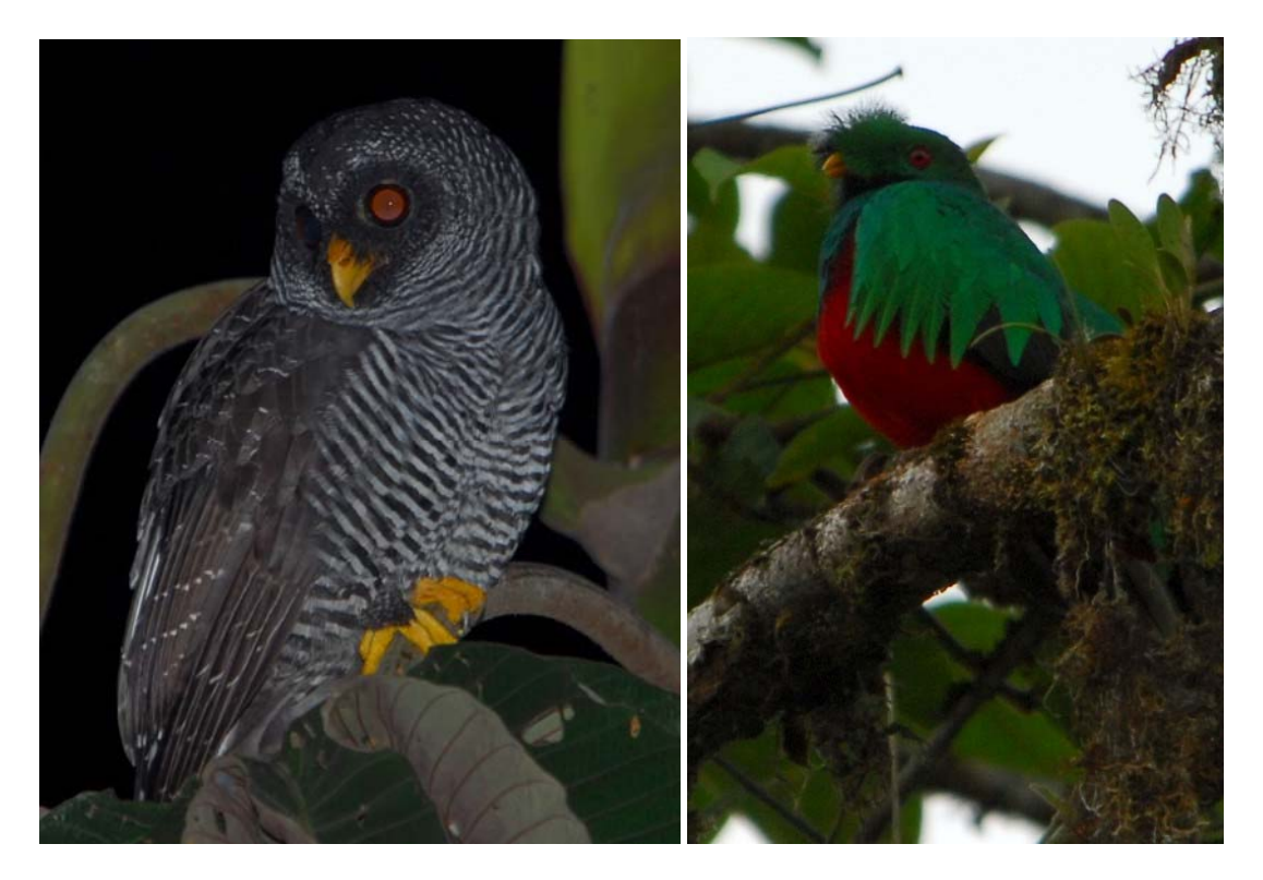
"San Isidro" (Black-banded) Owl; Crested Quetzal

Our full day at San Isidro was highlighted by morning views of Sickle-winged Guans, Crested and Goldenheaded Quetzals and various Hemispingus along the road, followed by a pleasant - if rainy and relatively quiet - forest hike. During the brighter afternoon we encountering a mixed flock along the road that included a large numbers of new flycatchers and, at dusk, a Slate-crowned Antpitta that had been calling in the roadside bushes.