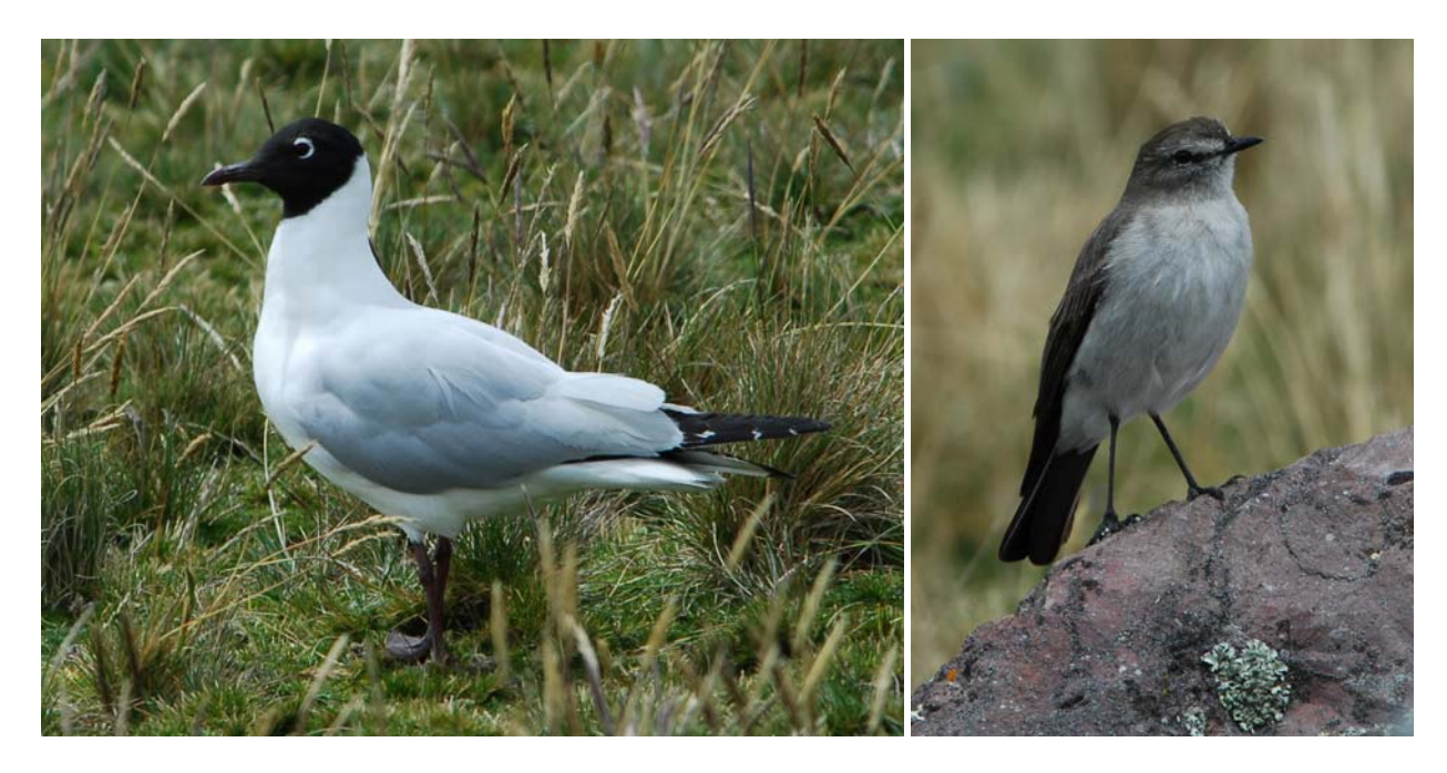
Andean Gull; Páramo Ground-Tyrant

Morning walks there added Mountain Wren, Barred Becard, Grass-green Tanager and Hooded Mountain-Tanager, White-capped Dipper (feeding young in a riverside nest), Torrent Tyrannulet and a stunning family of Torrent Ducks variously swimming in the white water and basking on the mid-river rocks. Feeders were frequented by many hummingbirds, including Sword-billed Hummingbirds, and Masked Flowerpiercers.