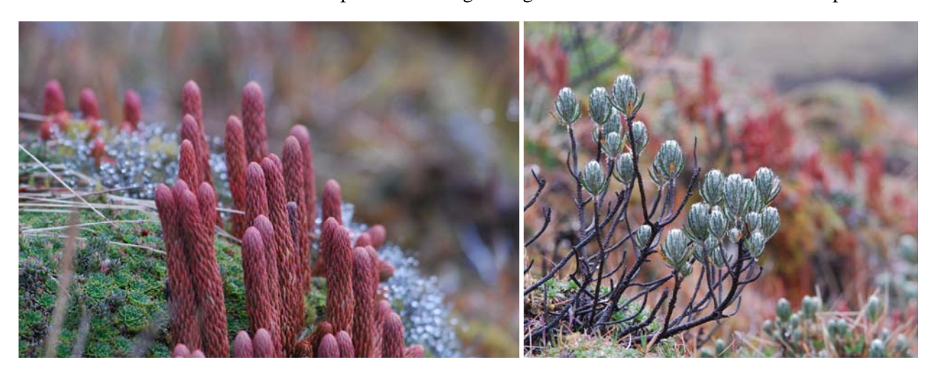
Páramo at ca. 4300m on Papallacta

From Antisana at ca. 4,000m we headed back down towards Quito and then climbed again up the Papallacta valley and across the watershed (stopping off to see Tawny Antpittas along the way). The afternoon rain ceased as we approached the highest elevations and eventually reached over 4,400m where we parked, then huffed and puffed our way uphill. In this cold, wet and misty landscape we saw Andean Foxes, Rufous-bellied Seedsnipe and a host of coral like red, green, silver and black plants covering almost every square inch. We then descended the eastern slope to the Guango Lodge to warm ourselves at a welcome open fire.