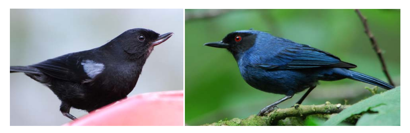
Glossy Flowerpiercer; Masked Flowerpiercer