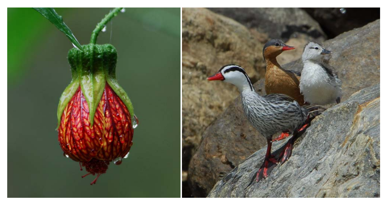
Torrent Duck (male, female and juvenile)

Morning walks there added Mountain Wren, Barred Becard, Grass-green Tanager and Hooded Mountain-Tanager, White-capped Dipper (feeding young in a riverside nest), Torrent Tyrannulet and a stunning family of Torrent Ducks variously swimming in the white water and basking on the mid-river rocks. Feeders were frequented by many hummingbirds, including Sword-billed Hummingbirds, and Masked Flowerpiercers.