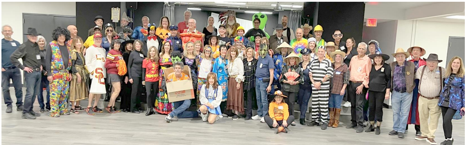
SO MANY PEOPLE WORE COSTUMES