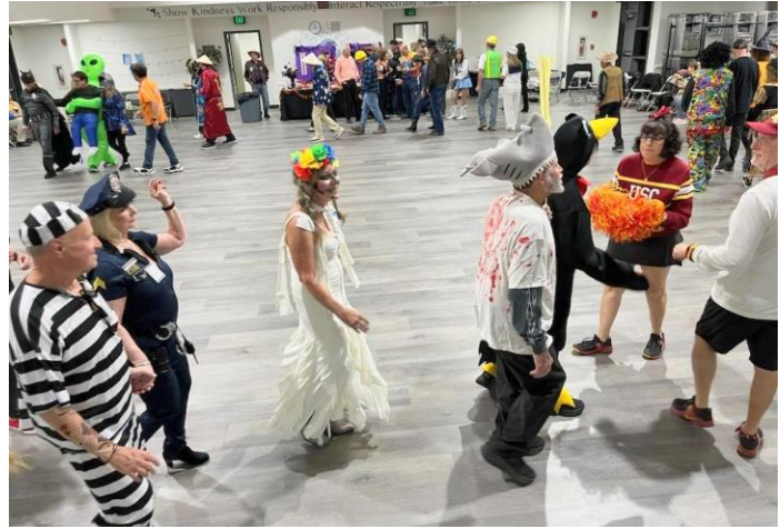
Circle of costumes