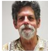
Snack King Avilicious