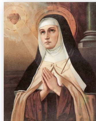
Feast Day: October 15

Sources: brittanica.com and catholic.org