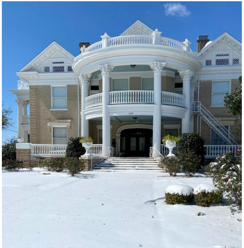
Our Woodward House, February 2021