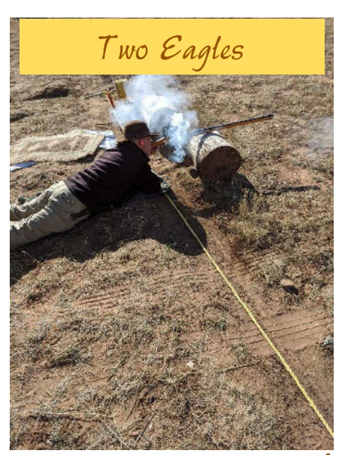
Follow us on facebook