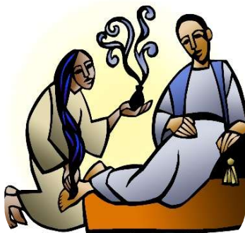
April 3rd 5th Sunday of Lent