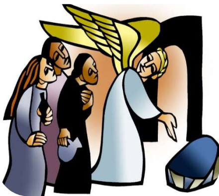
April 17th Resurrection of Our Lord Easter Day