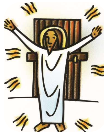
April 24th 2nd Sunday of Easter