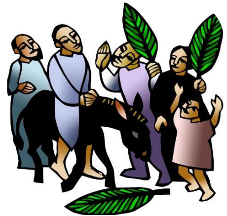
April 10th Sunday of the Passion Palm Sunday