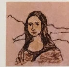
Da Vinci, Mona Lisa