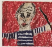
Picasso, Self Portrait