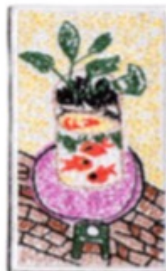
Matisse still life