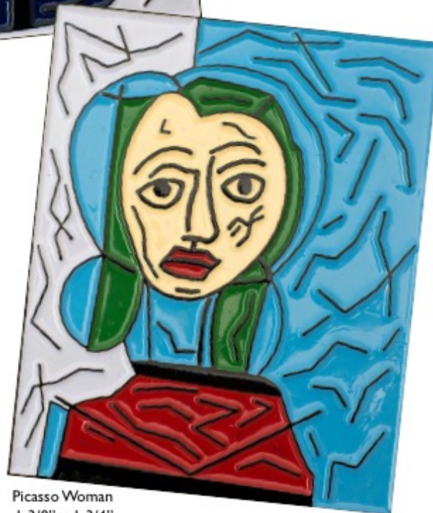
Picasso Woman 1-3/8" x 1-3/4"