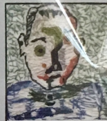
Picasso self portrait