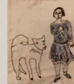
Munch, Girl with Dog