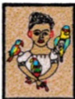
Kahlo & her parrots