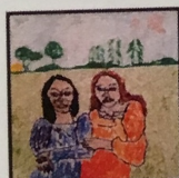
Gauguin, Two Women