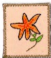
Orange flower 1-1/2" x 1-1/4"