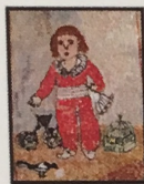
Goya, Red Boy