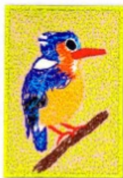
Kingfisher 3" x 2"