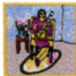
Matisse woman w/guitar

Each wearable Mini masterpiece art badge has a safety clasp pin back