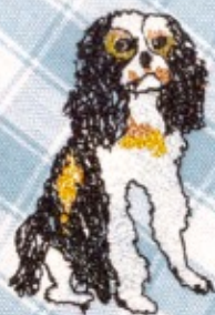
CAVALIER KING CHARLES