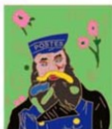
Van Gogh Postman 1-1/2" x 1-3/4"