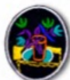
Still life 1-1/4" x 1"