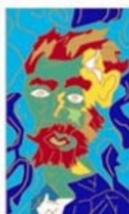
Van Gogh Self Portrait 1" x 1-3/4"