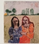
Gauguin, Two Women