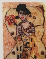
Klimpt, Woman in Gold