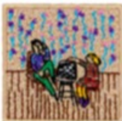
Matisse chess players