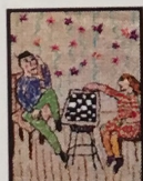
Picasso, Chess Players