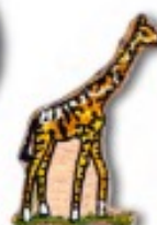
Giraffe 1-1/2" x 1"