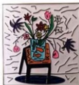
Matisse Still Life 1-5/8" x 1-3/4"