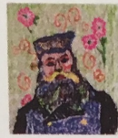
Van Gogh, Postman