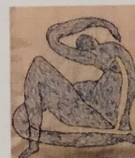
Matisse, Blue Nude