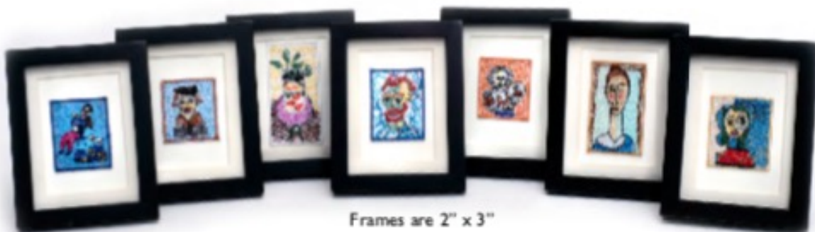
Frames are 2" x 3"