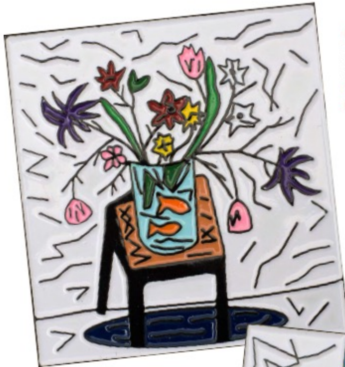
Matisse Still Life 1-5/8" x 1-3/4"