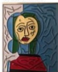
Picasso Woman 1-3/8" x 1-3/4"