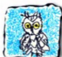
Yellow-eyed owl 1-1/2"