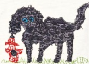
BLACK DOG & RED HYDRANT