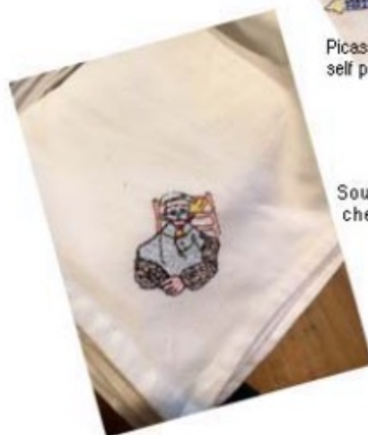
Picasso self portrait