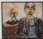
Wood, American Gothic