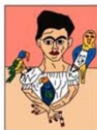
Frida's parrots 1-3/8" x 1-3/4"