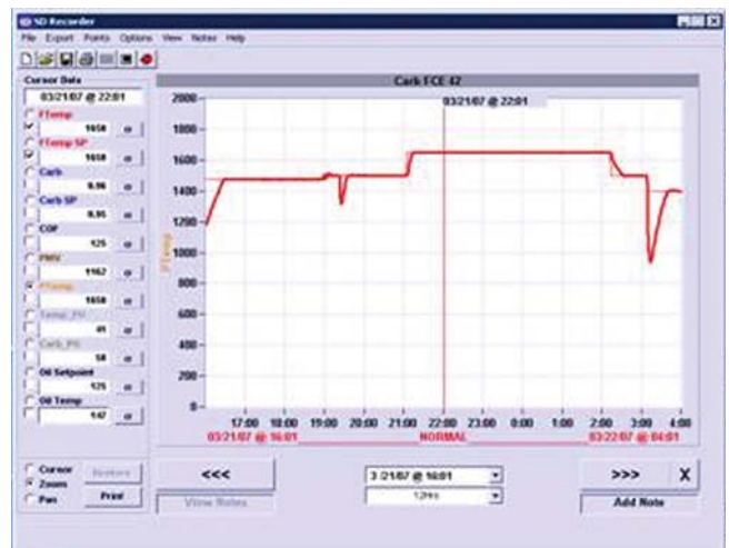
Fig. 4. Furnace chart displaying control with an intact radiant tube