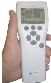
DPL4000 Hand-Held Unit