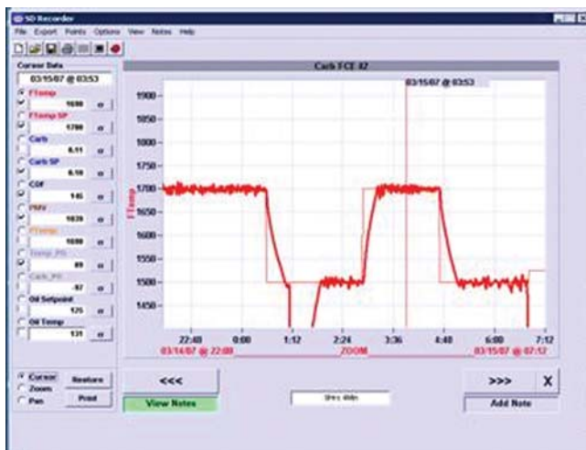
Fig. 3. Furnace chart displaying control with a cracked radiant tube

A consistent way to verify a correct burnout is to monitor the oxygen millivolts of the carbon controller during the burnout phase. If a proper burnout is taking place, the oxygen millivolts will drop below 200. This can also vary based upon the circulation in the furnace and the probe placement. If you are not able to reduce the millivolts based on the air supply available, you can turn off the circulation fan. This will allow the concentration of air passing across the tip not to be diluted.