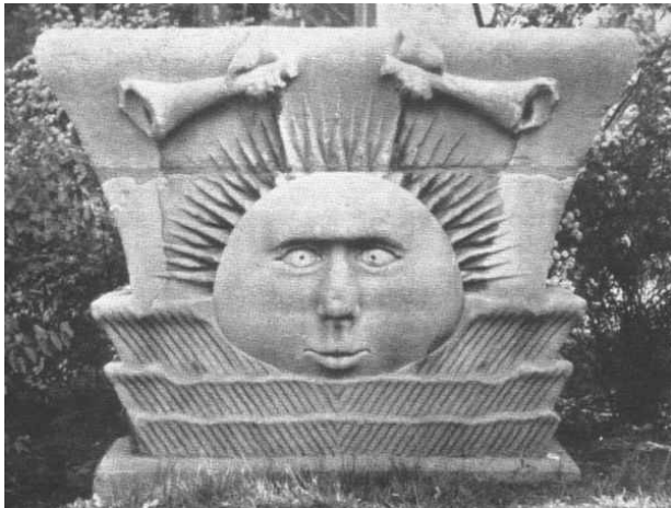
A sunstone from the original Nauvoo temple designed by William Weeks. The sun breaking through clouds symbolized the coming of light to illuminate a dark earth. Above each sun are two hands holding trumpets, heralding the dawning of the gospel.