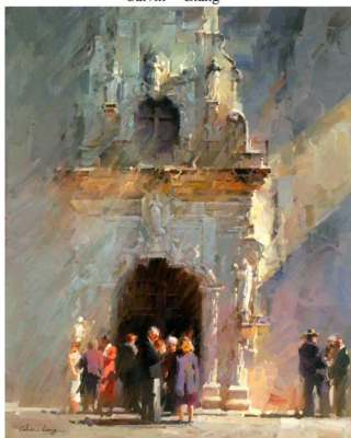
"Sunny Day in Mission San Jose" Oil on canvas 24"x30"