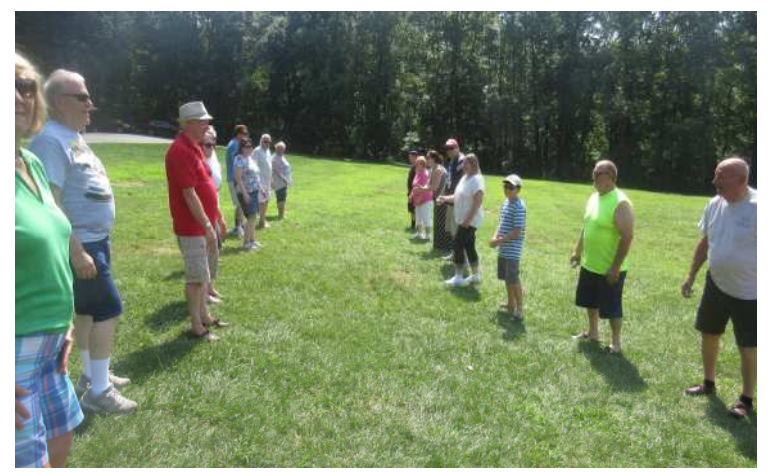
Egg Toss time