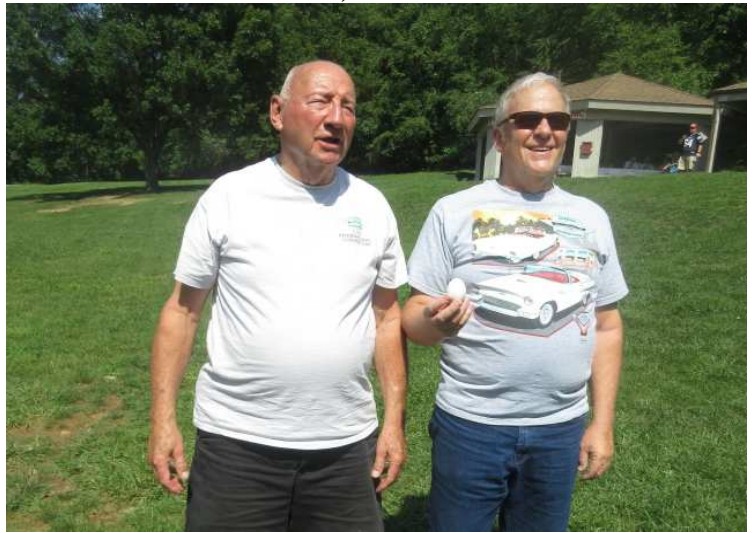
Egg Toss Winners

Pertronix Igniter and Pertronix Flame Thrower coil. For 57 and up Ford Distributor. Used Asking $60.00. Bill, 973-256-1212