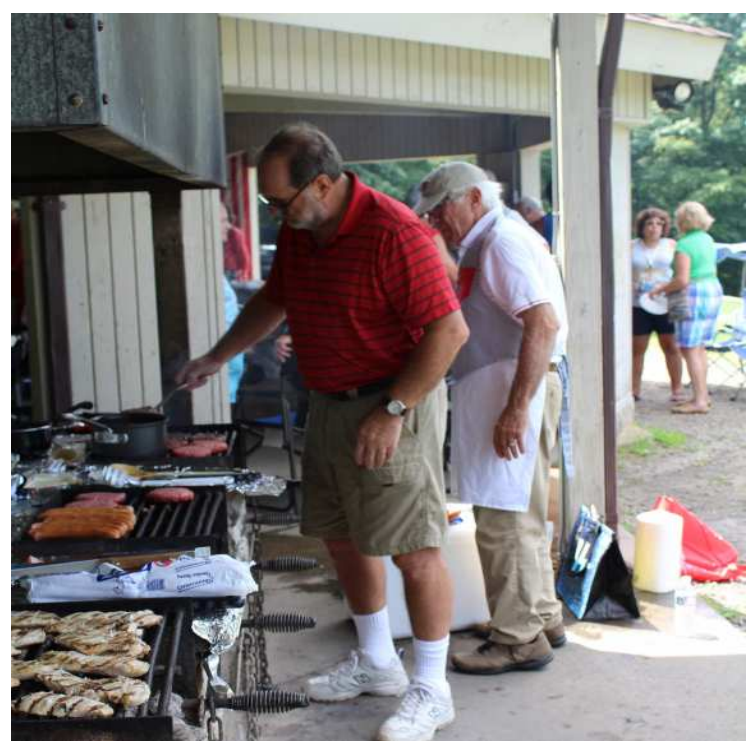
The cooks hard at work

car person. Car optional. Free coffee and munchies. 8 AM to 1 PM-<u>MGM Auto</u> <u>Body Supplies</u>, 344 Wagaraw Rd