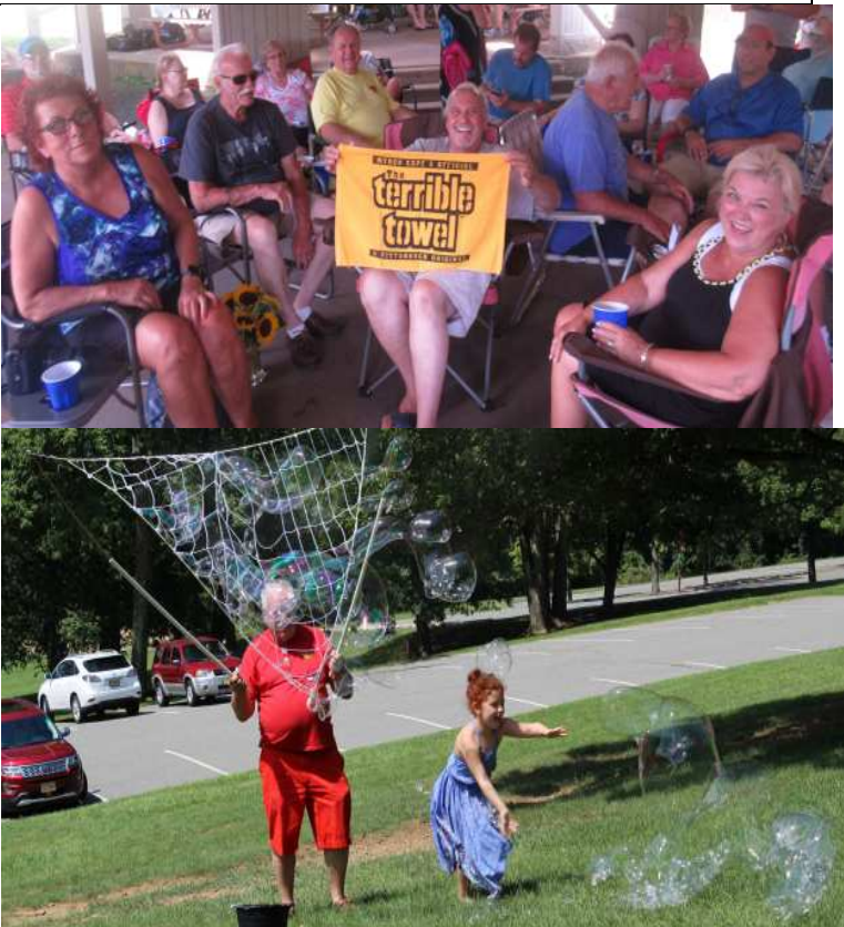
San Diego Convention The caravan is leaving Sept 5th. See you all there

http://holtononline.com/carshows.html http://www.newjerseycarshows.com/ www.njortc.org