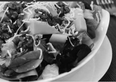
Chicken Lettuce Wrap