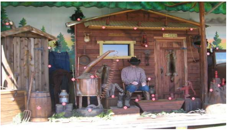
Diorama at the farm

What's Halloween without a hay ride to the pumpkin patch