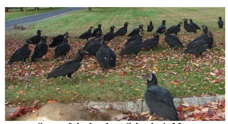
Some of the locals at Schooley's Mtn.