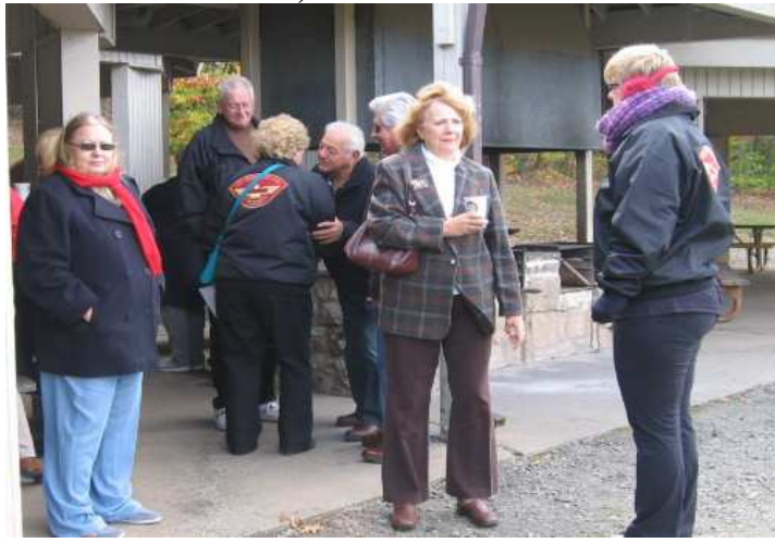
On the cool side