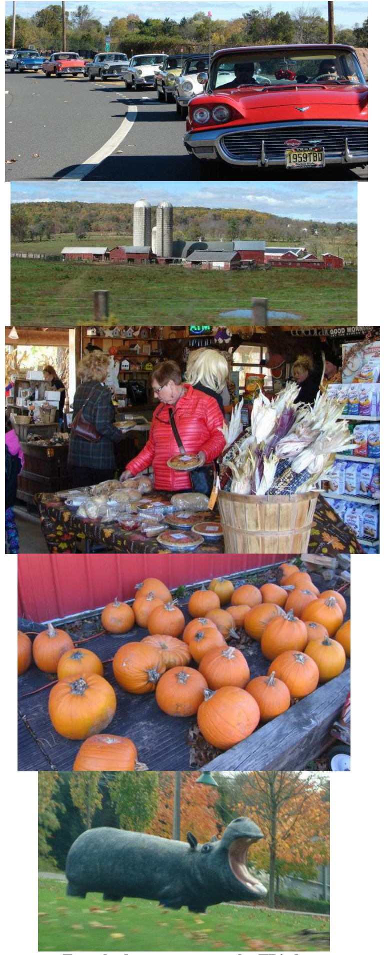
Everybody was agape at the TBirds