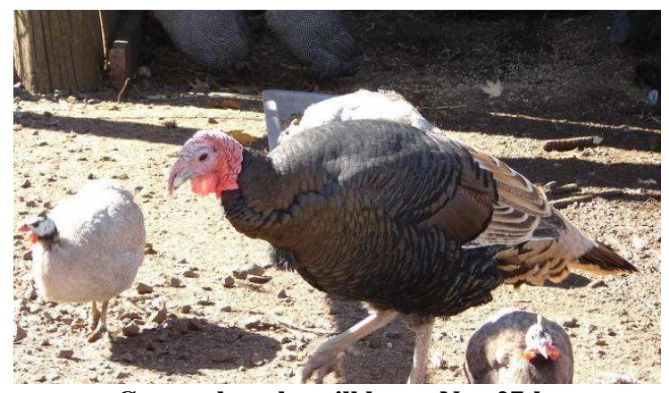
Guess where he will be on Nov 27th