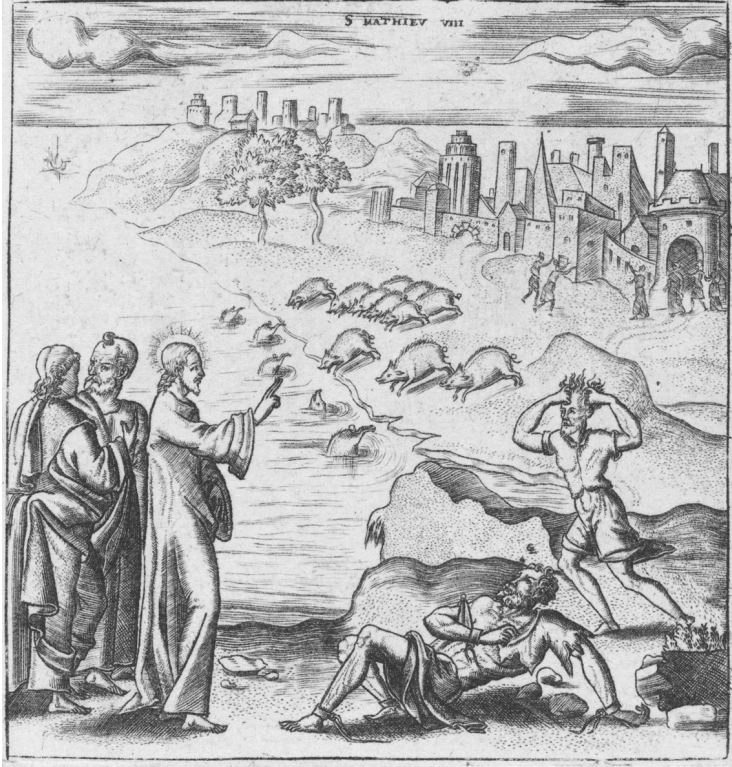
The Gadarene Demoniacs, 1576, Leonard Gaultier, engraving