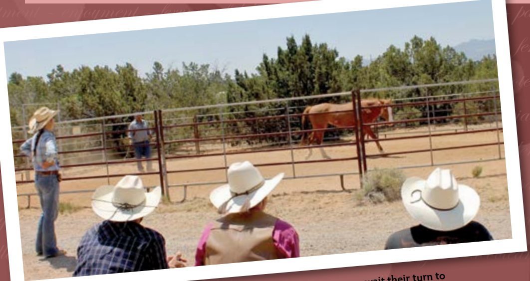
Essential groundwork begins in the round pen. Veterans wait their turn to establish a partnership prior to saddling up.