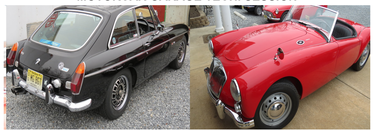
(above) MGBGT V8 "RH steer" at the Motorcar Garage Tech. Session