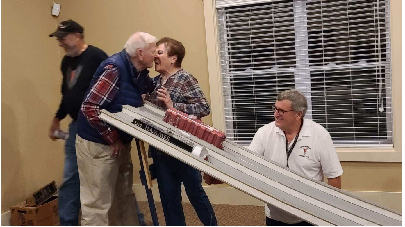
A little Husband Wife rivalry, but not too strong a rivalry that a kiss isn't in order before the start of the race.