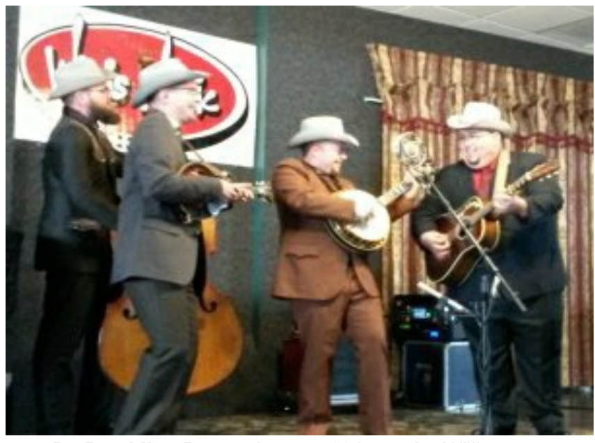
Po Rambling Boys - January 2017 on the Willis stage

(Check out article on page 4) You don't want to miss this one! $15 donation at the door Seating limited so get there early