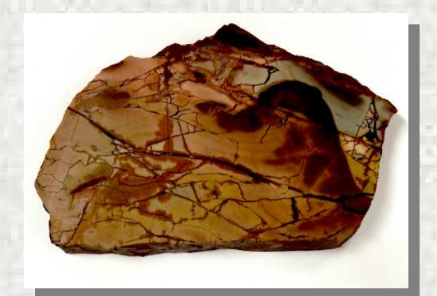
Dead camel jasper