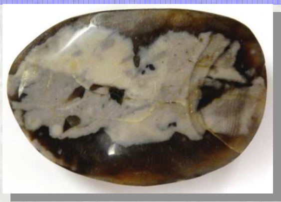
Cabochon by June Betts