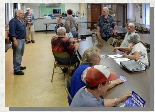
Members enjoying the pre-meeting