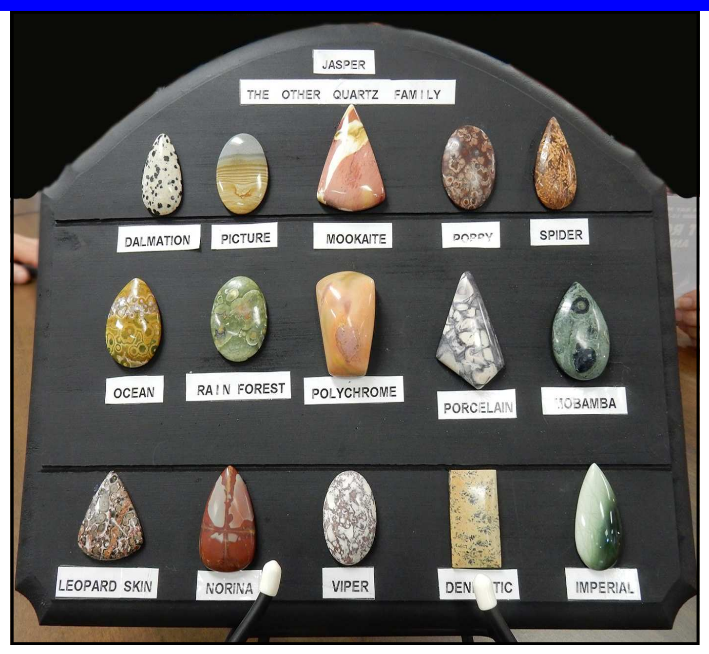
Jasper Display by Roger Wheeler