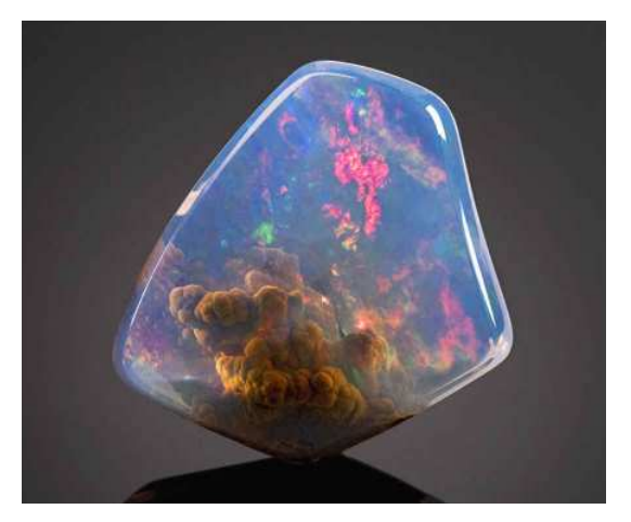
Answer in next month's Rock Talk.

Last Month's "What is It?" was Andalucite