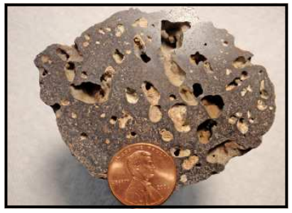
Unimpressive on the outside and on the inside.

ing and polishing the flat surface, there wasn't much if any additional detail to be seen. The entire rock is peppered with voids where gas was once trapped inside the molten material.