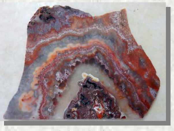
Red crazy lace jasper