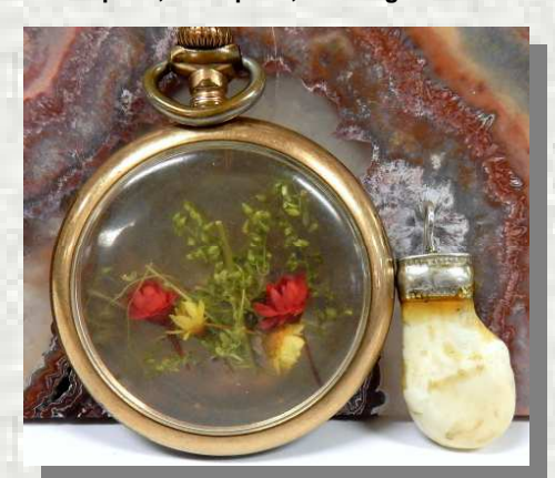
Creations by Dick Drum