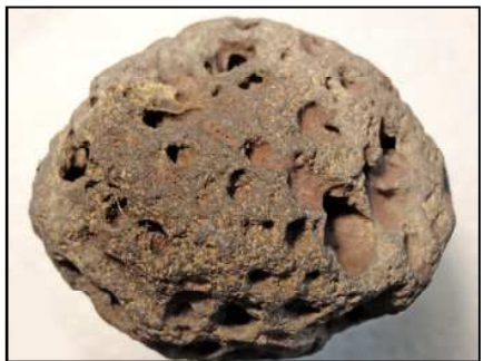
Melon gravel or scoria

relatively flood when Lake Bonneville collapsed about 17,000 years ago. [see October Rock Talk.] Next I used the rock grinder and polisher that I built earlier this summer [see August Rock Talk.] to polish the cut surfaces of each