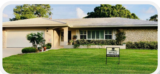
Many years of DIY upkeep on Maplewood