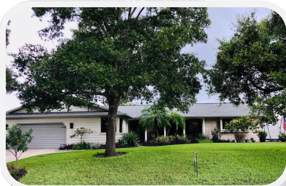
Bay Hills Dr lawn & landscaping project continues