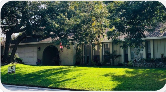
Bay Hills Dr owners cleared & re-sodded as DIY

Bay Hills Homeowners Association, Inc., PO Box 624, Indian Rocks Beach, FL 33785 Incorporated 1974 www.BayHillsFL.com