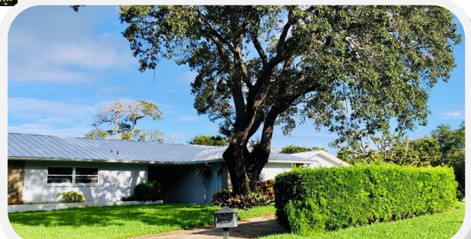
New well, sprinklers, sod and roof on Tanglewood