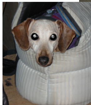
Where's the Ice?