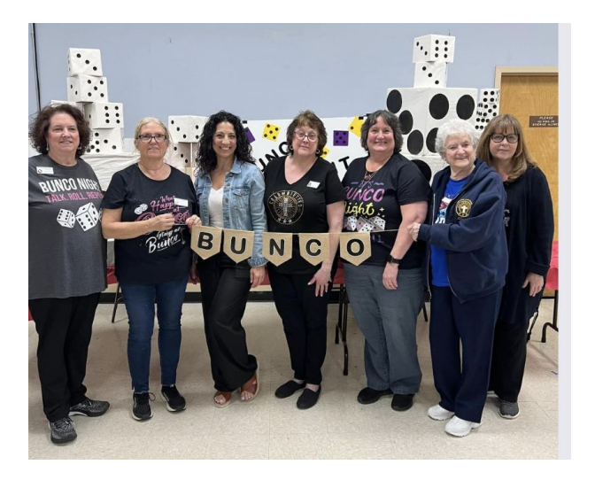
Our Bunco night was a HUGE success-Thank you for the team that gets it together!