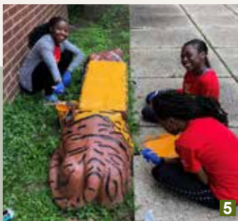
4 Cleaning up a mountain bike trail.