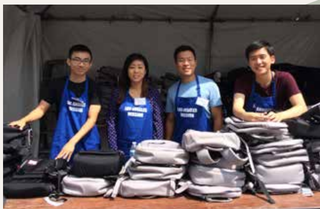
▣ Youth volunteers from BPAF service with an altruistic heart.