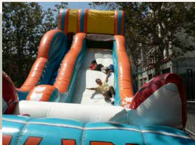
↑ Bounce House Slide!