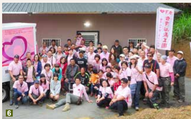
Youth Volunteer Corps 1 美國「青少年志工團」