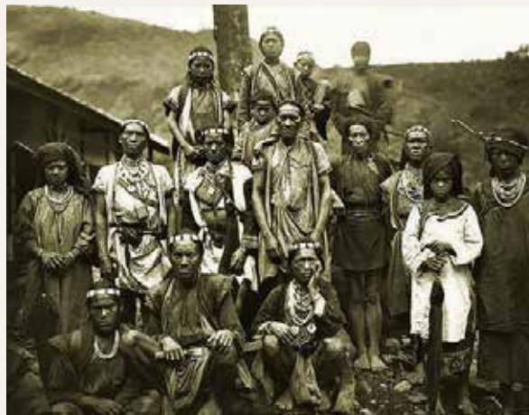
Taiwanese indigenous people in the early 20th century 20 世紀初原住民

台灣原住民因長期資源匱乏，屬於弱勢族群。所幸，近年因積極發展旅遊業，使其經濟得到改善，並以擁有其原住民文化為榮。