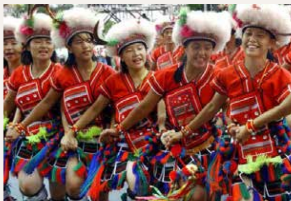
Indigenous girls are singing and dancing in a traditional festival.