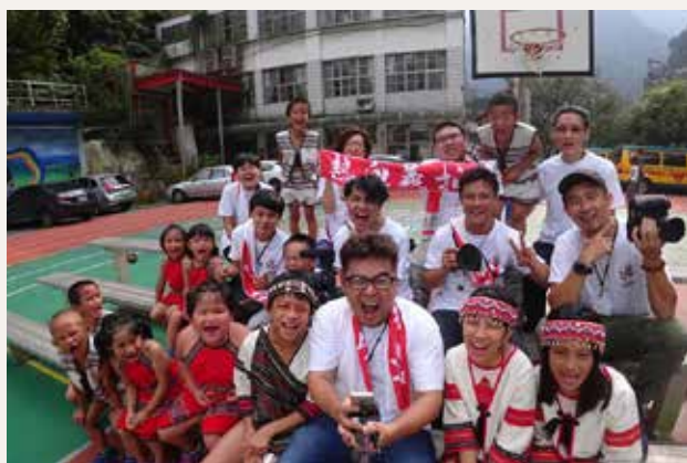
Many of the students of rural schools are indigenous children.