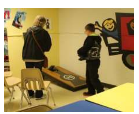
COAL IN THE HOLE FUN