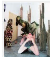
A Walk Through The Art. Artissima 2013