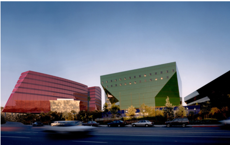
The Pacific Design Center in West Hollywood, Los Angeles, CA, home to the Young Projects Gallery.