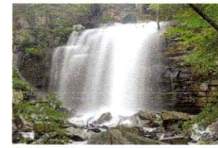
Dolan Branch Falls

Bays Mountain Park is a 3,750 acre nature preserve and state natural area. It is the largest municipal park in the state. Bays Mountain was historically used by Native Americans as a hunting ground. The first Europeans settled in the area in the late 1700s. Family farms dominated the landscape until construction of the reservoir in 1916, which served as Kingsport's drinking water supply until 1944. For over 100 years, families visited Bays Mountain for outdoor recreation and a connection to nature. In 1965 Kingsport began exploring options for permanently protecting this public use by creating a city park. This effort culminated in the opening of the Nature Center and the dedication of the park in 1971. Since that time, the park has continued to grow in size and resources. With a planetarium, nature center, native animal exhibits and a barge on the reservoir, the park focuses much of its resources on science education. An extensive hiking and biking trail system lends itself to outdoor recreation for all levels. The park's ecosystem is home to myriad plants and animals, big and small.