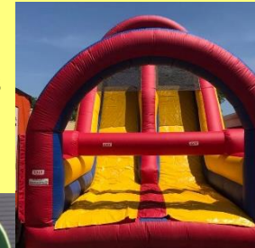
Large Slides $350 for 1st 2 hours $50/hr thereafter