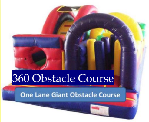
360 Obstacle Course