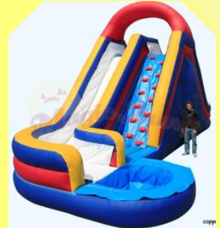
Huge Double 16ft Infinity Wet/Dry Slide $550 for 1 st 4 hours (Dry) $650 for 1 st 4 hours (Wet) $50 per hour thereafter