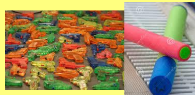
Water Wars Party Pack for 50 $150/hr (Incl water guns, water balloons, sling shots, much more)