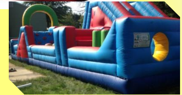
30-37ft Obstacle Courses $350 for 1 st 2 hours $50 per hour thereafter **MOST POPULAR**