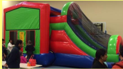
Bounce With Slide Combo $250 for 1 st 2 hours $50 per hour thereafter