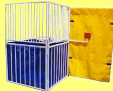
Dunk Tank $350 for 1 st 2 hours $50 per hour thereafter (you provide the water)

All prices ALWAYS Include Our Fun Staff Running The Station!