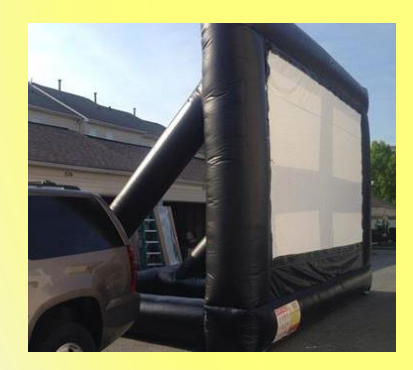
$300 for up to 3 hrs – screen only Add $200 for projector/sound (You provide the movie)