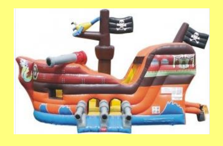
20ft Inflatable Pirate Ship $300 for 1<sup>st</sup> 2 hours, $50/hr thereafter