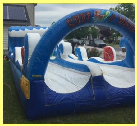
Giant Slip and Slides $350 for 1st 2 hours $50 per hour thereafter