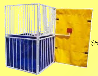
Dunk Tank $350 for 1st 2 hours $50 per hour thereafter (you provide the water)