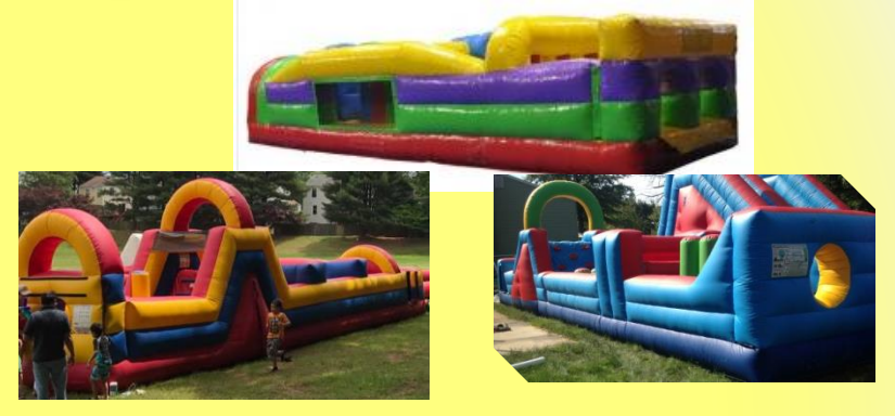
30-37ft Obstacle Courses $350 for 1st 2 hours $50 per hour thereafter **MOST POPULAR**