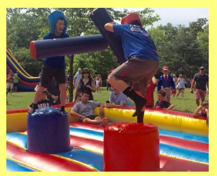
Joust $250 for 1<sup>st</sup> 2 hours $50 per hour thereafter