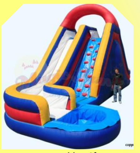
Huge Double 16ft Infinity Wet/Dry Slide $550 for 1st 4 hours (Dry) $650 for 1st 4 hours (Wet) $50 per hour thereafter