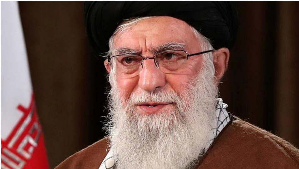
Ayatollah Ali Khamenei addresses the nation in a televised speech in Tehran on Sunday

Iran's supreme leader refused American assistance to fight the new coronavirus citing a conspiracy theory claiming it could be man-made by the United States government.