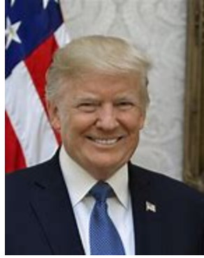
This is another of the TV Donald Trump, America president leader

In this picture, Donald Trump is wearing my mother. The hospital put my mother to be dead and she was not dead and has no reason to be in the hospital. Trump is wearing my mother inside him, and he is wearing her smile and her teeth with a split in the front of the teeth. I saw one of my mother and she was not herself. When I saw her, I asked her if she went to heaven and she said yes. I did not need to ask any more questions, as I already know what to expect. My mother has no bone inside her body including her head. And she has nothing in her belly. I told my mother about who the devils are and she said she believes in her Jesus, and she will continue praising her Jesus. This the deception America and Britain put in my Earth Elevations and Chreations. The British, the Republicans, and the American governments take the heavens and put in the Falkland Islands. They put the Tur Turbine winds into the skies, and they put in the heaven's skies in the Falkland areas. The Turbine winds is extremely strong and the wind in the Falkland Islands is extremely strong and it feels like it is going to blow you away. The air is icy and the wind makes everything dry and there is no trees The wind can blow children away if they are outside.