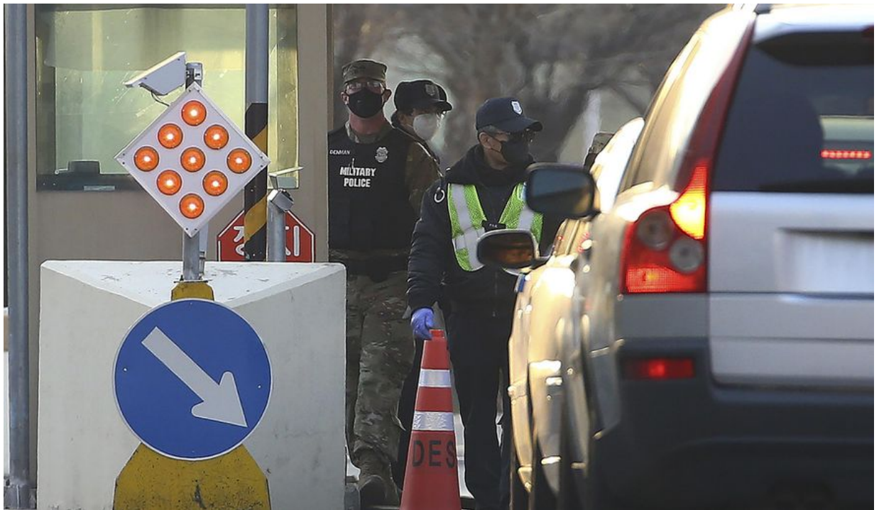
In this Thursday, Feb. 20, 2020, photo, a U.S. military policeman and South Korean security persons U.S. Army base Camp Walker, in Daegu, South Korea. The U.S. and South Korean militaries, used to being on guard for threats from North Korea, face a new and formidable enemy that could hurt battle readiness: a virus spreading around the world that has infected more than 1,200 people in South Korea.

Russia and China flood web with coronavirus outbreak lies blaming U.S.; State Dept. fights back. State Department combats China's attempt to reshape narrative, blame Washington