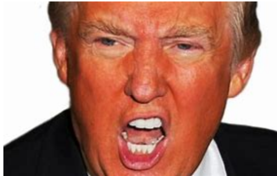
Donald Trump, America President

Below are pictures of some of the devel politicians, devel government leaders, devel state leaders and others that destroyed all the Esistences and Everyone and everything in November 2019 with the many explosives and bombs they build and they set off. All of them are on fire burning and they will never ever stop burning. Many of them have those they say is dead from the Corona Virus wearing as skin to cover their burning shame and disgrace including Queen Elizabeth II that esist in the British areas also called Britain, England, Great Britain, English, and United Kingdom. These are the names of some of my states she and the kings before her teef and cut out and put under her. America put them and themselves as leaders over every country, every state, every esistences inside this Earth, and outside the Earthsz. All of you Burnsz Burnsz Burnsz Burnsz Burnsz Burnsz Burnsz Burnsz.