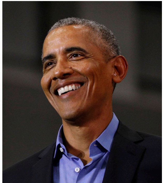
Barak Obama, America President