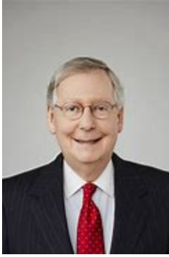
Mitch McConnell, Republican Leader of the Republican Party