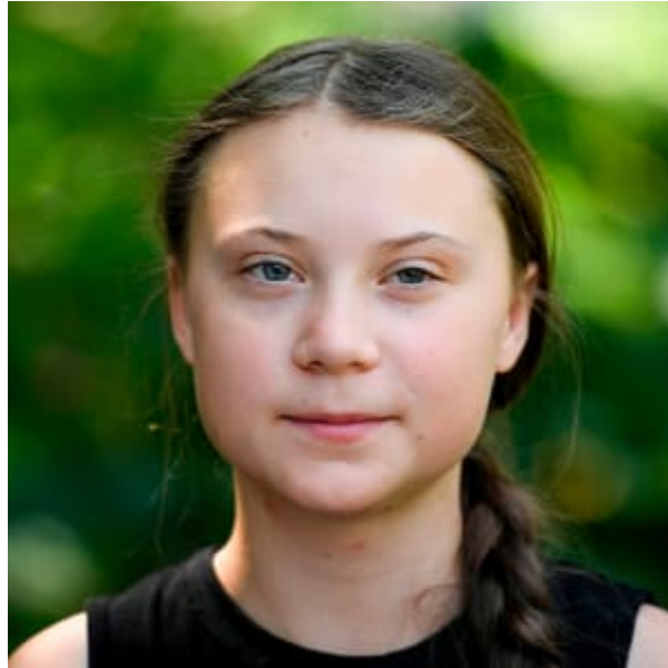
Greta Tumberg, a pretending Swedish climate youth activist That is a devel that destroyed my Earthsz with her other devel

The hurricanes we experienced is the military using the many Tur turbine fans to blow air from the oceans into the earth areas and caused the many tidal waves, and the many floodings. The red liquid the firefighter use to stop the blaze only expand the fire. It must be blue powder water with nothing removed from it to use to stop fires. It is the sea salt, and other salt to use to stop the fires including the volcanoe fires. The salt and the blue can be mixed to stop stronger fires. All of you know know what to use to stop the fires and the disasters, but you are destroyers and terror and you are deliberately destroying our life. The army is well versed with many wickedness that they use with their hands.