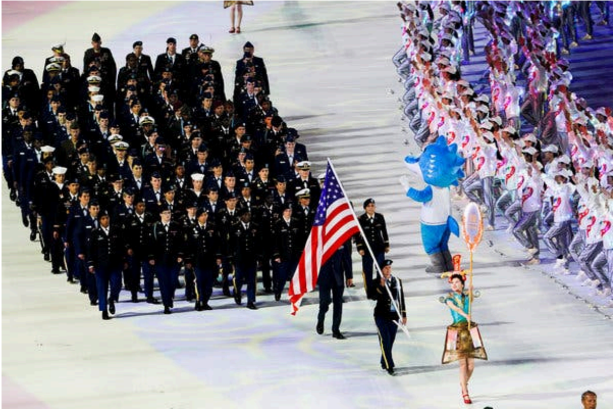
The Pentagon sent 17 teams with more than 280 athletes and other staff members to the Military World Games in Wuhan, China, in October.

BEIJING — China is pushing a new theory about the origins of the coronavirus: It is an American disease that might have been introduced by members of the United States Army who visited Wuhan in October.