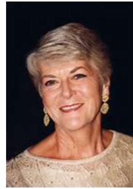
Geraldine Ferraro, American Diplomat, and Attorney