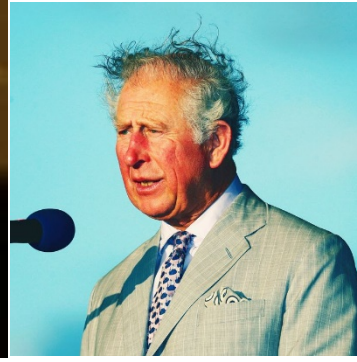
Prince Charles of British