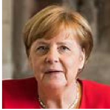
Angela Merkel/Trump Chancellor of Germany