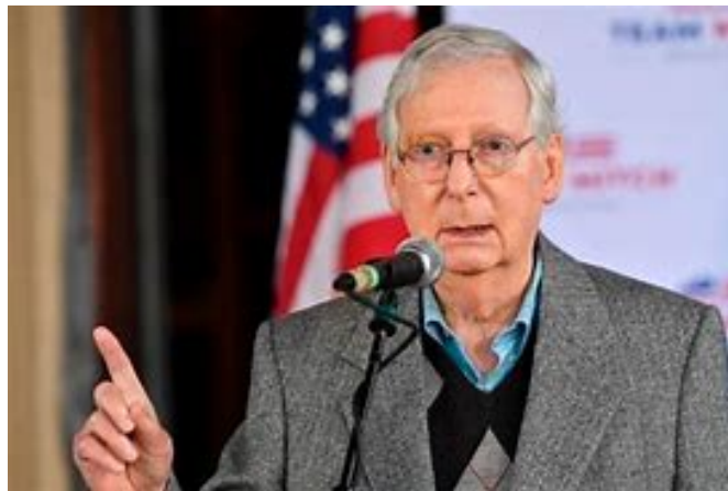
Mitch McCallum, Senator