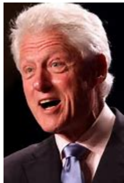
Bill Clinton America President