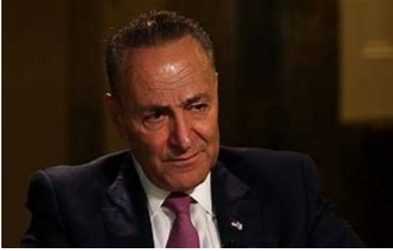
Chuck Schumer, Politician