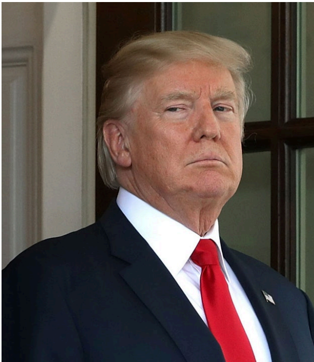
Donald Trump, America President