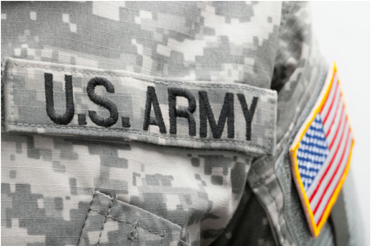
A Chinese government spokesman has tried to blame the US army for the deadly coronavirus outbreak, which was declared a pandemic by the World Health Organization this week.

Chinese Foreign Ministry spokesman Zhao Lijian claimed Thursday that the US military might have brought the COVID-19 virus to the Chinese city of Wuhan, where the outbreak emerged in December.