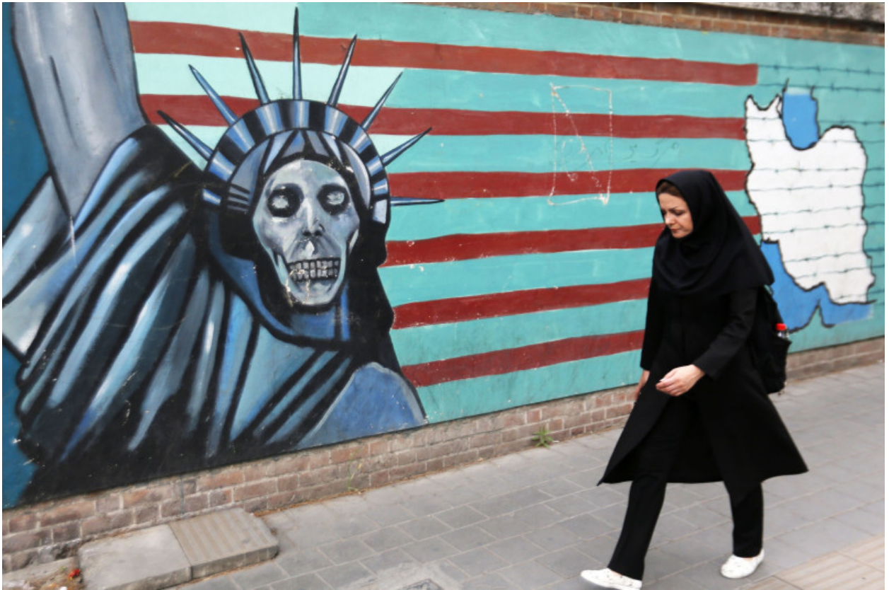
An Iranian woman walks past an anti-American mural on the wall of the former U.S. embassy in Tehran on May 8, 2018.

Iran Knows Who to Blame for the Virus: America and Israel. The regime's ideological army is spinning conspiracy theories even as it helps spread the virus among Iran's long-suffering people. BY KASRA AARABI | MARCH 19, 2020, 9:51 AM