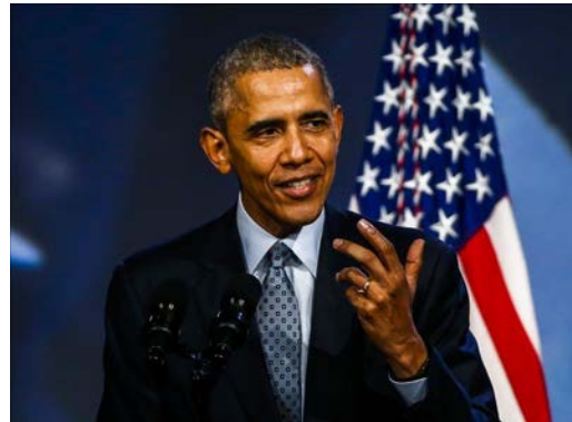
Barak Obama, America President