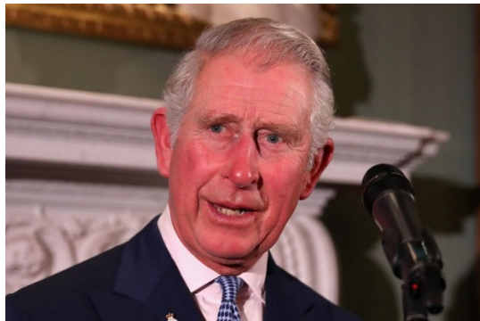
Prince Charles of British