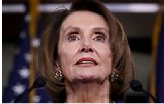
Nancy Pelosi - Speaker of House of Representatives

Later in the day, the Senators including Mitch McConnell and Nancy Pelosi began to torture me with many instruments and many devel strong hands, strong back, and strong legs. They used many wicked things to torture me and to torture my children. Including in this torture on my children is one of my babies that the devel teef from his Mom about 8 months old, only wearing a pampers. The devel abduct him from a baby and they keep him as a devel baby, and he grew up with the devels doing devel wickedness, and he is a well-grown man. The devel has him destroying me, and he doesn't know that he is my child. One day while I call everyone to me, I sang to them, and I rocked them to sleep and relax. While singing and rocking them, they became the age they were when they began doing devel work, and it was so alarming as they were all kids, babies, and children under eight years old. I cleaned them up and I put them where they must be, and someone takes them away and put them back into devel work. Some of them are from the Tur, Tures, Turgeese and Tergeese and some other arias and some of my children from my Chreations.