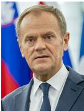
Donald Tusk, former President of the European Council from Tuskegee under Tergeese esistence

Angela Dorothea Merkel [a] ( née Kasner; born 17 July 1954) is a German politician who has been Chancellor of Germany since 2005. She served as Leader of the Opposition from 2002 to 2005 and as Leader of the Christian Democratic Union (CDU) from 2000 to 2018. [10] A member of the Christian Democratic Union, Merkel is the first female Chancellor of Germany. [11] Merkel has been widely described as the de facto leader of the European Union [12][13] and the most powerful woman in the world. [12][13] Merkel was born in Hamburg in then-West Germany, moving to East Germany as an infant when her father, a Lutheran clergyman, received a pastorate in Perleberg.