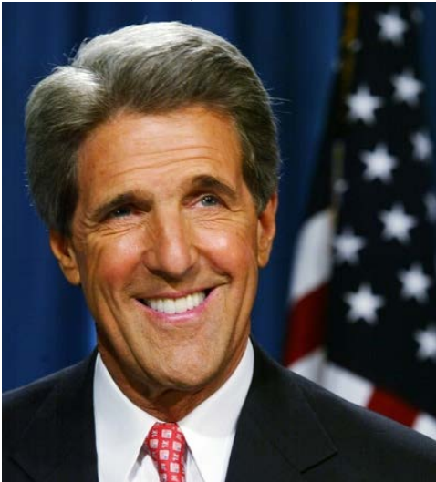
John Kerry, Politician