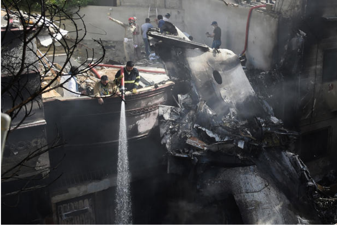
Firefighters spray water on the wreckage of a Pakistan International Airlines aircraft after it crashed at a residential area in Karachi on May 22, 2020.

A passenger jet carrying 98 people crashed Friday into a residential neighborhood of the Pakistani city of Karachi. Pakistan International Airlines said flight PK 8303 went down with 91 passengers and 7 crew on board.... A source at the airport told CBS News the pilot had informed the control tower that one of the plane's two engines had failed. The control tower told the pilot that two runways were clear for landing, but air traffic control lost communication with the crew and the plane crashed shortly after. Witnesses reported seeing an engine on fire before the plane came down. https://www.cbsnews.com/news/pakistan-international-airlines-plane-crash-karachi-casualties .