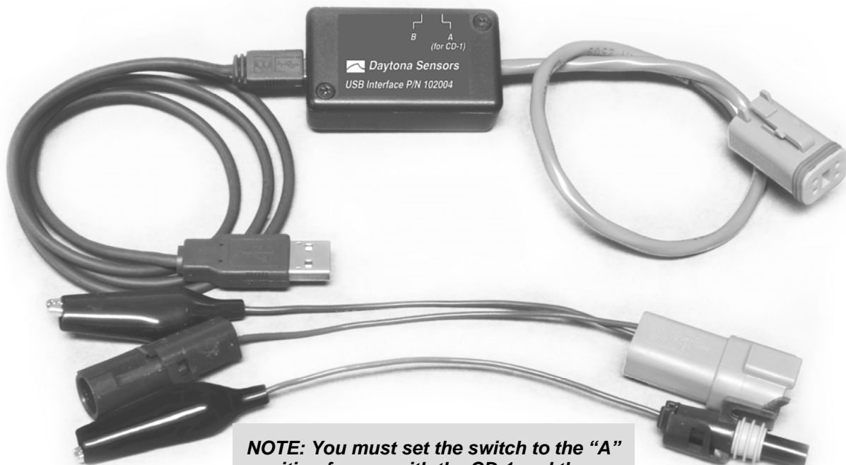
Figure 1 – USB Interface with Adapters

NOTE: You must set the switch to the "A" position for use with the CD-1 and the "B" position for use with the SmartSpark.