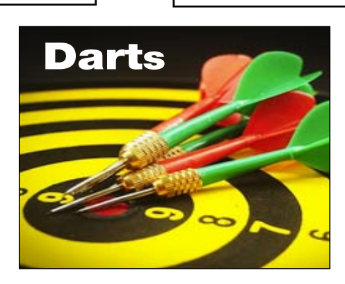
Every Thursday starting at 6:00 p.m.

Colorado Elks Association January-December 2024 Raffle $20 for the card, winner each day Please see bartender to purchase.