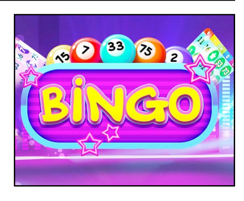
July 3rd & 17th 6:30 to 9:00 p.m.