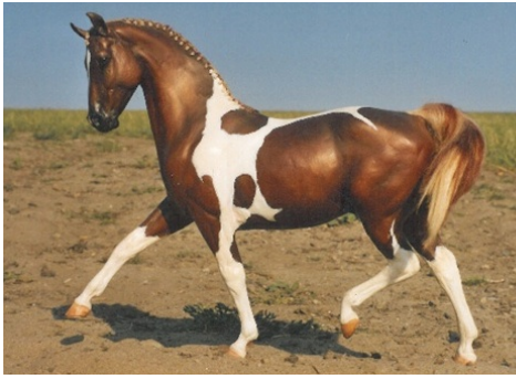
CHAMPION PATTERNED COLOR: FLYING DUTCHMAN (JG)