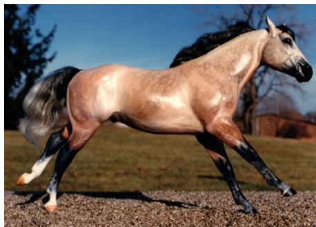
RESERVE CHAMPION GREY/ROAN: WOLF TYPHOON (AC)

Palomino (15): 1-SKS Aristo Khat (CM), 2-Vanye (AC), 3-Goldwillow (AC), 4-Tony Harken (AC), 5-Antara RM Starbird (AC), 6-Ima Gold Nugget (CM), 7-Brookridge Goldenrod (APo), 8-D.O. Fast Forward (JW), 9-Impressive Gold J (JG), 10-My Sputnik Baby (CV)