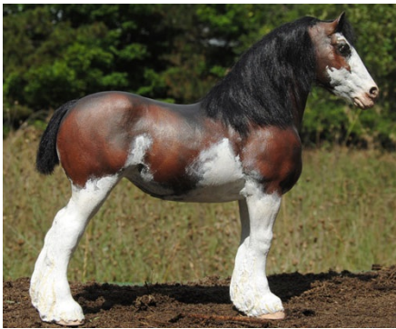
SPARROWOOD BEAUTY (SSu)