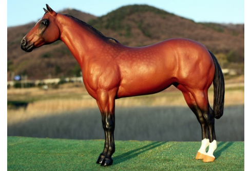
CHAMPION REPAINT: RED TRIBU- TION (AC)

Repaint: Smaller than Classic (10): 1- Banned From Argo (AC), 2-En Fuego (CR), 3-Charisma (CC), 4-DQ Jim Dan- dy (SSt), 5-Deloyer Clarion (CV), 6-Khry- stal Music (CH), 7-Tanzer (CH), 8-Bito Babe (AC), 9-Dexi's Midnight Runner (SSu), 10-Ravyn (SSt)