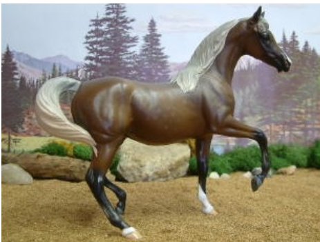
RES. CHAMPION OTHER COLOR: LADY IN MINK (APo)

1990s COLOR DIVISION OVERALL CHAMPION: TC (CM)