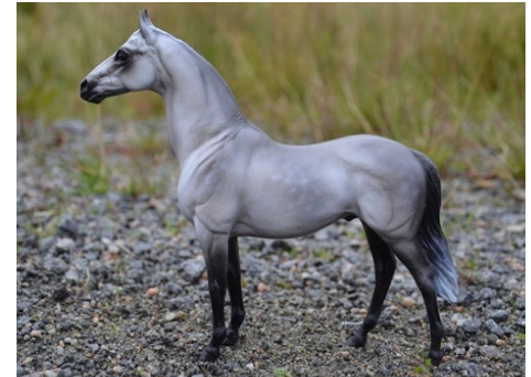
RESERVE CHAMPION REPAINT: TEMPLE LORD (SN)

Repaint w/Hair M/T: Trad. or Larger (41): 1-Buckthorn (SM), 2-Golden Malicious (SM), 3-PR Eldorado Spanish Rose (JV), 4-Skipa Tomacina (JW), 5-GGK Tiqatu (SN), 6-Gateado Mancho (AC), 7-TS Galilean Dragoness (MP), 8-Tel El-Amarnas Seeba (SN), 9-TS Squall Line (MP), 10-Poco Reina (NF), HMs-LBR Ebony Patches (JG), LBR Poco Bar (JG)