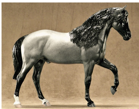
CHAMPION GREY/ROAN: TRUENO AZUL (CM)

Roan (25): 1-Trueno Azul (CM), 2-Lady of Trieste (CM), 3-Cyberlena San (JG), 4-KT Continental Rose (CM), 5-Moonlight Lady (HC), 6-The Mad Cookie (CV), 7-Banned From Argo (AC), 8-Justy (AC), 9-Simmerl (SN), 10- Stormaway Zephyr (AC), HM-Goodbye Blue Monday (CV)