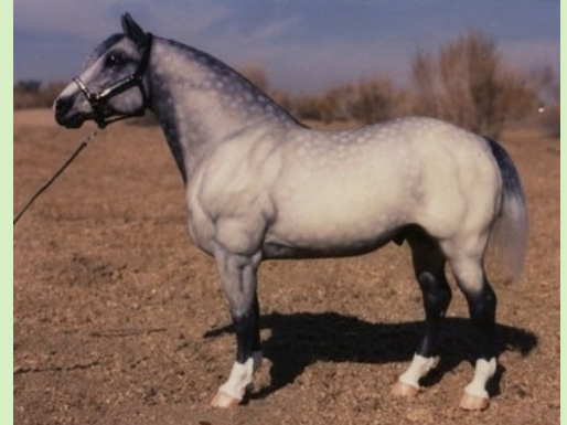
Smoke Bar Syndicate 35 Years Old!

(Have one created in 1964, 1969, 1974, 1979, 1984, 1989, 1994, or 1999? Get it into the Birthday Barn spotlight by e-mailing its photo and info to our Gmail address below!)