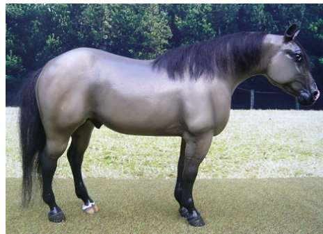
CHAMPION CREAM/DUN COLOR: MO' BETTER BLUES (JV)

Dun/Grulla (18): 1-Mo' Better Blues (JV), 2-Abraxas (AC), 3-Ragnarok Hyoga (AC), 4-Rattlesnake Shake (AC), 5-Atom Vinter (AC), 6-TS Grassland Sunrise (MP), 7-The Altus Kid (AC), 8-Ragnar Lothbrok (KW), 9-Dun Stormin' (JV), 10-Mellyna (JG)