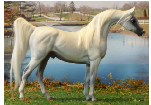
CHAMPION MAJOR REMAKE/REPAINT/HAIR OR SCULPTED MANE/ TAIL: KAS DREAM DANCER (BH)

Major Remake & Repaint with Non-Hair M/T: Smaller than Classic (4): 1-Strange Meadowlark (AC), 2-Moonlight Cocktail (CV), 3-Wishful Thinking (KM), 4-Lykke (AC)