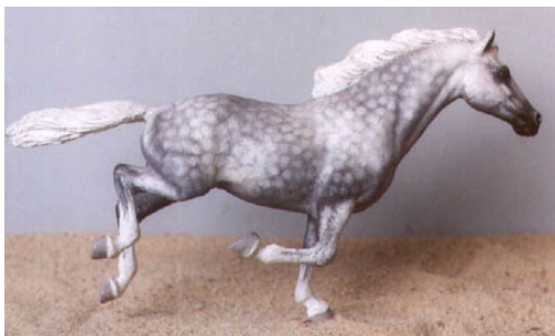
1960s/1970s WORKMANSHIP DIV. OVERALL CHAMPION: *THE RAISULI (CH)