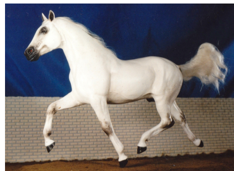
RESERVE CHAMPION SPORT BREED: LAAG (AC)

Paso Fino/Peruvian Paso (10): 1-Marquesa (CM), 2-Huaricanga (KW), 3-TS Jalapeno (MP), 4-TS Crystal Conchita (MP), 5-Tesoro D Oro (JW), 6-Abricotine Bleu (JV), 7-D.O. Caballo del Sol (AC), 8-PR Balenciaga Brio (JV), 9-Lad Amigo (HC), 10-Raven (HC)