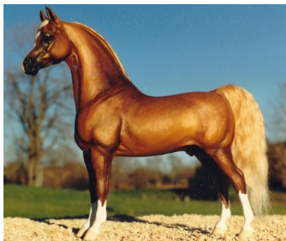
CHAMPION BASE COLOR: RYO ASUKA (AC)

Black (19): 1-TS Elegant Gypsy (MP), 2-Warm Leatherette (AC), 3-Brigante (AC), 4-Nyx (AC), 5-Wings of Darkness (AC), 6-RM Zakuro (CV), 7-Business As Usual (HC), 8-Dessaiz (AC), 9-Grendel (AC), 10-So Supreme Threat (CM)