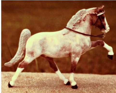
Gone But Not Forgotten: Vintage customs that no longer exist

Gaited Breed (1): 1-Roaring Roan (CM) [pictured at top of next column]