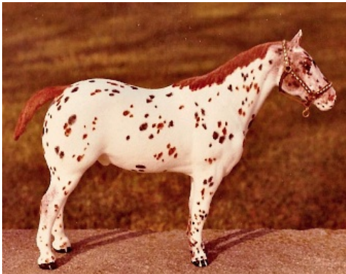
Stock Breeds (1): Kingpin Machado (CM)

Breed Classes: Photo formats other than 35mm or digital