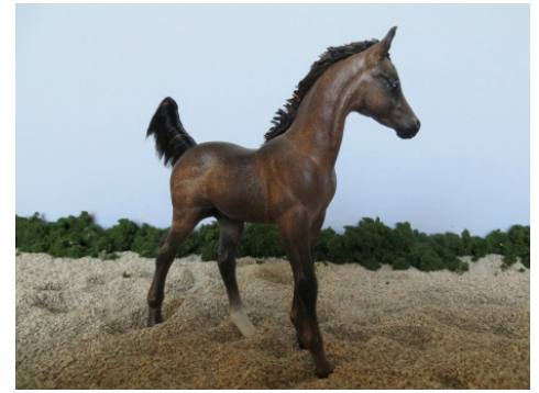
CHAMP. FOAL: CROWN ROYAL (CH)