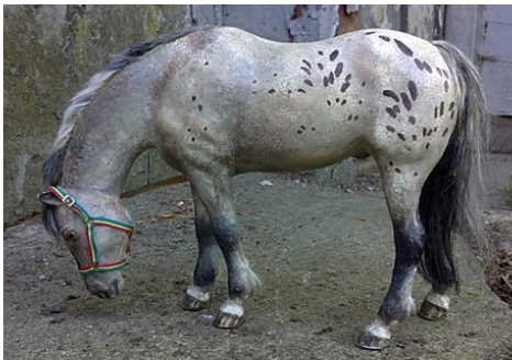
CHAMPION PONY/MINIATURE HORSE: LBR TJORBEN (JG)

Other Pure or Mixed Pony Breed (7; "What a nice class!"): 1-LBR Tjorben (JG), 2-Tug Hill Minstrel (CM), 3-Tug Hill Pied Piper (CM), 4-Ravi Stones (CV), 5-Southern Cross (CM), 6-KT Draublakken (JG), 7-Althea (SR)