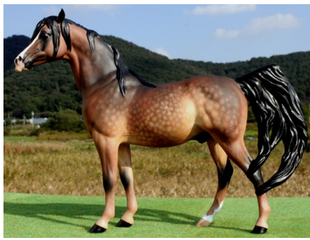
CHAMPION LIGHT BREED: SHIRAMBA KAMUI (AC)

Other Pure or Mixed Light Breed (9): 1-TS Desert American Queen (MP), 2-KT Bunduki (RN), 3-Maskav (BA), 4-Unplugged (APa), 5-Carolina Girl (SSt), 6-Fool's Gold (BA), 7-PR Malika Siglavia (JV), 8-Dream Theater (SR), 9-LJ Hit It Hal (SM)