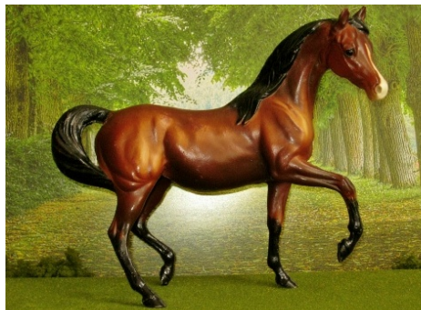
RES. CHAMP CUSTOM W/FACTORY PAINT: FIREO (NF)

Repaint: Trad. or Larger (13): 1-Andro Umeda (SM), 2-Korsakov (CH), 3-*Rebel Bint Sahra (CH), 4-Follow the Moonlight (AC), 5-Sheneyn Alar (CH), 6-Tejas Treasure (VM), 7-Trigger Mortis (AC), 8-Azure Lady (SSt), 9-Khemo's Silhouette (CV), 10-Yukon Starlight (CV)