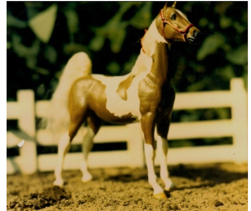
Model Horse Scenes

Foals (2): 1-Eye Twinkler (NF) [pictured at top of next column], 2-My Name Is Michael (SS)