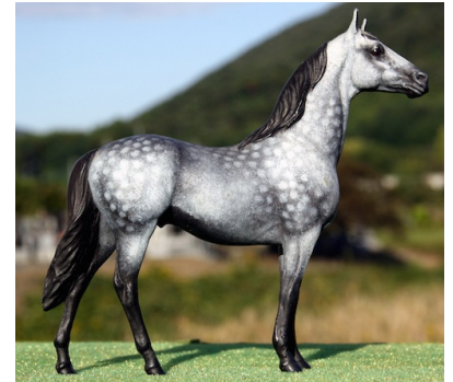
CHAMP. SPORT: ATTN EVILDOERS (AC)

Other Pure or Mixed Sport Breed (6): 1-Tadeusz (AC), 2-Wing'd Jaguar (SSu), 3-Jack of Hearts (AC), 4-Flashover (SSt), 5-Legendary (AC), 6-Flash of Gold (AC)