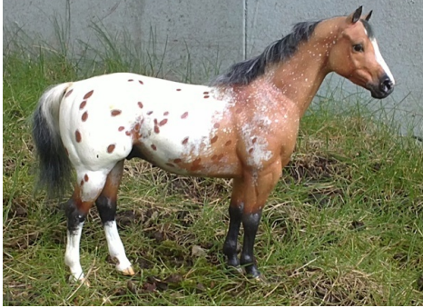
RESERVE CHAMPION PAT TERNED COLOR: ROCK RIDGE (JG)

Longear/Exotic (8): 1-Imagine That (SR), 2-So Molson Canadien (SSu), 3-Gentleman John (BH), 4-Belle Kabong (AC), 5-Gallimaufry (SSu), 6-Ironwood Glenn (SSt), 7-Pam-Mule-A (KW), 8-Bob (SSu)