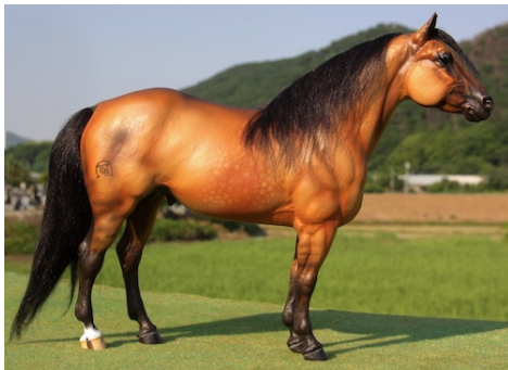
RESERVE CHAMPION STOCK BREED: BUCKTHORN (SM)

Arabian (67): 1-Asuka Ryo (AC), 2-Gosamer Wings (KW), 3-Warlord (NF), 4-KAS Dream Dancer (BH), 5-Sentinel (CV), 6-RAS Shiraz (KW), 7-RM Pravda (CV), 8-RAS Khatifa (CM), 9-Second Impakt (CV), 10-RAS Zen Amako (AC), HMs-Sea of Storms (CV), TS Black Velvet (BH), PR Khalifa Bint Sakir (JV)