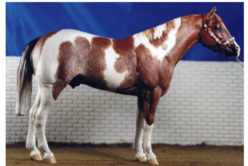
RESERVE CHAMPION PATTERNED COLOR: SASURAI KID (AC)

Longear/Exotic (34): 1-Harry (HC), 2-Jeb (SSu), 3-Wylie (JG), 4-Waltzing Ma-