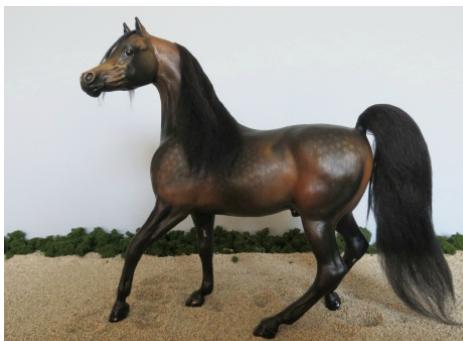
CHAMPION SIMPLE REMAKE/REPAINT/HAIR OR SCULPTED MANE/TAIL: VALENTINO (CH)

Simple Remake & Repaint w/Non-Hair Mane/Tail: Smaller than Classic (3): 1-Not Now Ni- San (AC), 2-Precision (CH), 3-DW Interpretation (HC)