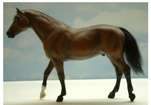
RES. CHAMPION REPAINT/HAIR OR SCULPTED M/T: MINSTREL'S JOY (APo)

Simple Remake & Repaint w/Hair M/T: Trad. or Larger (5): 1-Diamond Red Hawk (CM), 2-Polaris (SSt), 3-Cutter's Pokey Pine (CM), 4-Summer Breeze (SSu), 5-Tejas Little Eagle (CM)