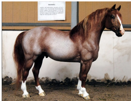
RES. CHAMPION SIMPLE REMAKE/REPAINT/HAIR OR SCULPTED MANE/ TAIL: RED REBEL (SSu)

Major Remake & Repaint w/Hair Mane/Tail: Trad. or Larger (96): 1-RAS Shiraz (KW), 2-Warlord (NF), 3-Baby's Diamond Cabaret (APa), 4-RAS Elian Demoiselle (CM), 5-Special Print (RN), 6-Plastique (SSu), 7-Mars Flash (AC), 8-Uncle Kracker (BH), 9-Ima Rock-A-Teer (CM), 10-Mo' Better Blues (JV), HMs-RAS Zen Amako (AC), LBR Kybele (RN), Willie's Wyld Fire (RN)