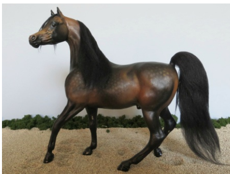
RESERVE CHAMPION BASE COLOR: VALENTINO (CH)

Dapple Grey (59): 1-Angel Queen (CV), 2-Jamil Mhuratt (CR), 3-Mon Nafa Rani (CR), 4-Iron Butterfly (AC), 5-Diamond Blue Rose (CR), 6-FO Oparan (SSu), 7-Phantom Lover (CV), 8-Sylver Crescent (CM), 9-Listentotheechoes (AC), 10-Asteroid Blues (AC), HM-Ladyinthelake (KM)