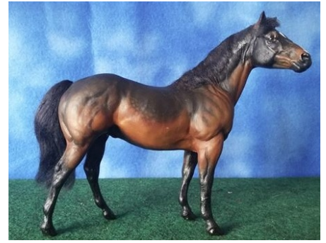
(CV), 5-lbn Sparkalot Plaudit (APo)