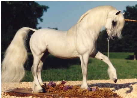
RES. CHAMPION LONGEAR/EXOTIC/FANTASY: RHEANTH (AC)

Stock Breed Foal (28): 1-Quita Cowboy (SSu), 2-Solar Frost (APa), 3-Dream Again (KM), 4-KT Continental Rose (CM), 5-Cheyennes Sugar (JG), 6-Bear Bandit (AC), 7-Peacock Joey (HC), 8-Gold Dust (JW), 9-Pretty Impressive (VM), 10-Class Action (CM), HM-Areka Chika (HC)