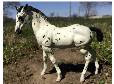
RES. CHAMPION FOAL: NORTHERN LAD (SR)