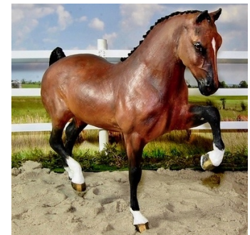
BIRCHWOOD GEISHA BOY