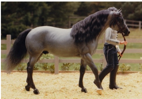
RES. CHAMPION PONY/MINIATURE HORSE: JUSTY (AC)

Longear (7): 1-Belle Kabong (AC), 2-Ironwood Glenn (SSt), 3-Gallimaufry (SSu), 4-Gentleman John (BH), 5-So Molson Canadian (SSu), 6-Pam-Mule-A (KW), 7-Bob (SSu)