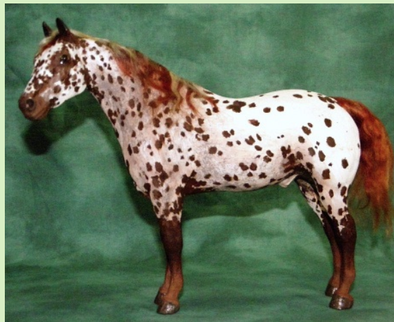
Diamond Red Hawk 45 Years Old!