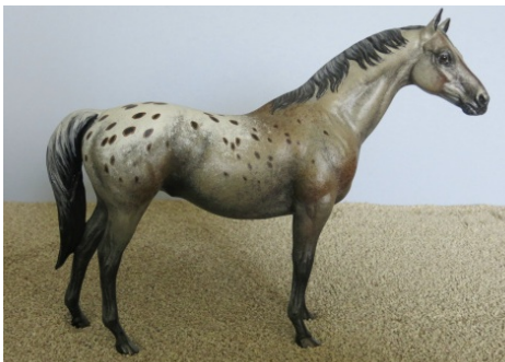
CHAMP. REPAINT: SAGE WIND (CH)

Repaint: Smaller than Classic Size (5): 1-Wing'd Jaguar (SSu), 2-Starship Phoenix (AC), 3-Winds of Change (CH), 4-Pick Me A Winner (APa), 5-Rihanna (APo)