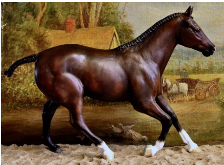
RES. CHAMPION BASE COLOR: DARK PHOENIX (SSt)

Dapple Grey (16): 1-Diamond Handsome Devil (BH), 2-Penny Arcade (BP), 3-Attn Evildoers (AC), 4-Wickenden Osprey (AC), 5-Millennium Falcon (AC), 6-Winds of Change (CH), 7-*Quest (AC), 8-Follow the Moonlight (AC), 9-*Rebel Bint Sahara (CH), 10-Ibn Hotep (SSt)