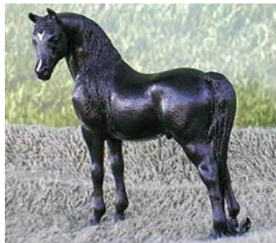
RES. CHAMPION LIGHT BREED: GROUCHO (BH)

Thoroughbred (9): 1-Attn Evildoers (AC), Winds of Change (CH), 3-Penny Arcade (BP), 4-Be A Hero (AC), 5-Minstrel's Joy (APo), 6-Seventh Moon (AC), 7-Imagineer (AC), 8-Flying Fare (CM), 9-Frostfang (KM)