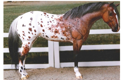
CHAMPION PATTERNED COLOR: D.O. GO WILD (RN)

Other Pinto Patterns (57): 1-Special Print (RN), 2-Strange Meadowlark (AC), 3-Mars Flash (AC), 4-Visibly Crazy (SN), 5-Never So Blue (JV), 6-D.O. Sky Dreams (RN), 7-DW Street Legal (CV), 8-Ima Jetalino (SR), 9-Apache Lace (VM), 10-Kentucky Bugaboo (SSu), HM-LBR Megafleet San (RN)