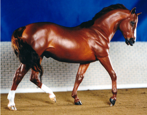
Master Derby 25 Years Old!