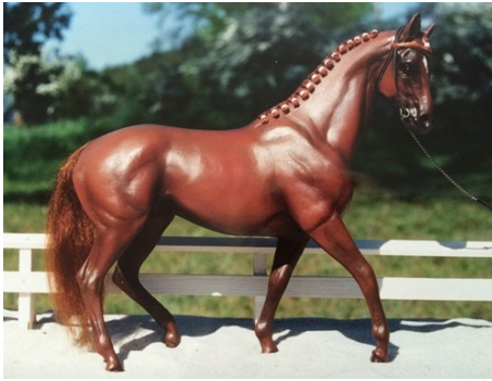
CHAMP REPAINT/HAIR OR SCULPTED MANE/TAIL: HALF A SHADOW (SN)