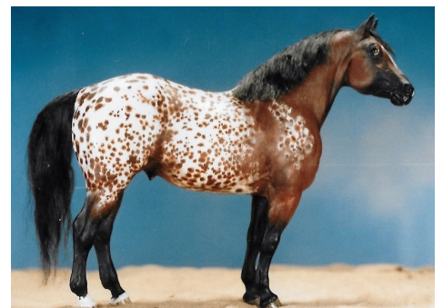
CHAMPION PATTERNED COLOR: ROCKING CHAIR RENEGADE REVEL (CM)

Other Pinto Pattern (9): 1-The Pied Viper (AC), 2-Polaris (SSt), 3-Tejas Treasure (VM), 4-Pick Me A Winner (APA), 5-Singing Grass (CV), 6-Baricza (APo), 7-Flashover (SSt), 8-Love Gun (APo), 9-Melulu (CV)