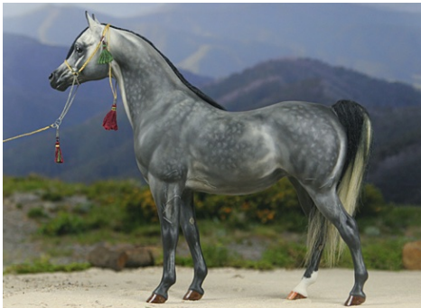
CHAMPION REPAINT/HAIR OR SCULPTED MANE/TAIL: MON NAFA RANI (CR)

Repaint with Non-Hair Mane/Tail: Smaller than Classic: no entries