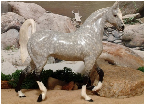
RESERVE CHAMPION GAITED BREED: CINDY LOU WHO