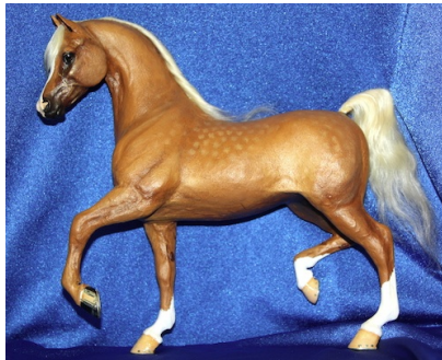
RESERVE CHAMPION LIGHT BREED: FIRE DANCING (CV)

Thoroughbred (21): 1-Master Derby (AC), 2-Half A Shadow (SN), 3-Temple Lord (SN), 4-Claudia (SN), 5-Katana (SN), 6-Uncle Kracker (BH), 7-Waltzing Matilda (AC), 8-Rikiishi (AC), 9-In The Dark (SR), 10-Cry Dream (SN), HMs-Super Trooper (JV), Raspberry Beret (SR)