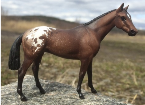
RESERVE CHAMPION REPAINT/HAIR OR SCULPTED MANE/TAIL: I'M IMPRESSED (SN)

Simple Remake & Repaint w/Hair M/T: Traditional or Larger (74): 1-Red Rebel (SSu), 2-Mona Lisa Overdrive (CV), 3-Seeonee Elegy (AC), 4-Impressive Heart (JG), 5-D.O. Go Wild (RN), 6-DW Street Legal (CV), 7-LBR Joker B (JG), 8-Amantus VS (SN), 9-PR Monstella Storming Home (JV), 10-TS Dragon Warrior (MP), HMs-Never So Blue (JV), Walad (SN), TS Grassland Sunrise (MP)