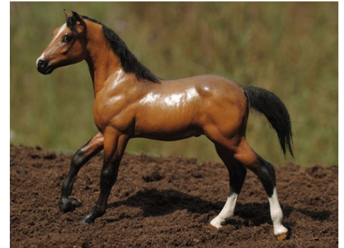
RESERVE CHAMPION FOAL: QUITA COWBOY (SSu)

1980s BREED DIVISION OVERALL CHAMPION: MON NAFA RANI (CR)