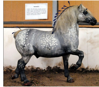
2-Lady Jessica (CV), 3-Wrang Bo Deedy (AC), 4-Black Hand (CV), 5-Diamond Playtime (CM), 6-Jokers Dice (AC), 7-Lady Red Diamond (APo)