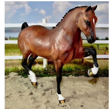
RES. CHAMPION SPORT: BIRCHWOOD GEISHA BOY (BP)

Paso Fino/Peruvian Paso (1): 1-Trigger Mortis (AC)