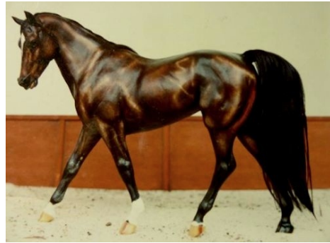
RESERVE CHAMPION SPORT BREED: ASSASSIN SLEW (AC)

Paso Fino/Peruvian Paso (8): 1-Mago CDM (KM), 2-Trueno Azul (CM), 3-Stephano (JW), 4-Diamond Majestad (CM), 5-Encantador (CM), 6-Tony Harken (AC), 7-Reynarda (AC), 8-Cancion De Amor (APo)