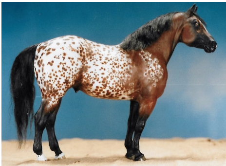
RES. CHAMPION STOCK: ROCKING CHAIR RENEGADE REVEL (CM)

Arabian (21): 1-*The Raisuli (CH), 2-Andro Umeda (SM), 3-Mustafa Bey (CV), 4-Anca-