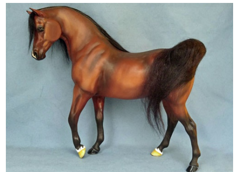
RES. CHAMPION MAJOR REMAKE/REPAINT/HAIR OR SCULPTED MANE/ TAIL: RAS SHIRAZ (KW)