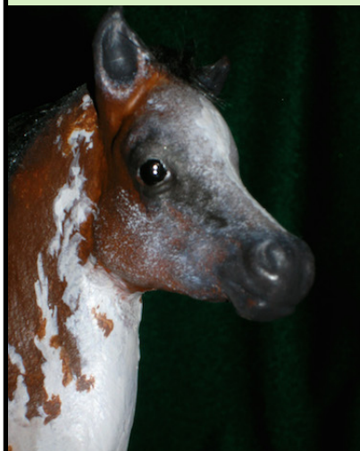
Melulu 40 Years Old!