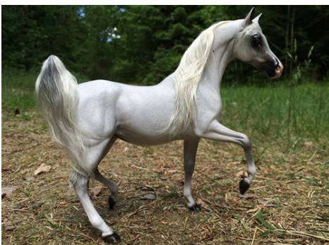
RES. CHAMPION REPAINT/HAIR OR SCULPTED M/T: SHANYA (SN)

Simple Remake & Repaint w/Hair Mane/Tail: Trad, or Larger (89): 1-Valentino