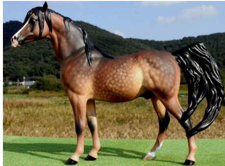
CHAMPION SIMPLE REMAKE/REPAINT/ HAIR OR SCULPTED MANE/ TAIL: SHIRAMBA KAMUI (AC)

Simple Remake & Repaint with Non-Hair Mane/Tail: Smaller than Classic (4): 1-Ziggy (HC), 2-Marlayna (SR), 3-Skip Mount (RN), 4-Autumn Storm (HC)