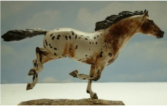
RES. CHAMPION PATTERNED COLOR: TUMBLEWEED (APo)

Longear/Exotic and Other Realistic Color and Fantasy Color: no entries