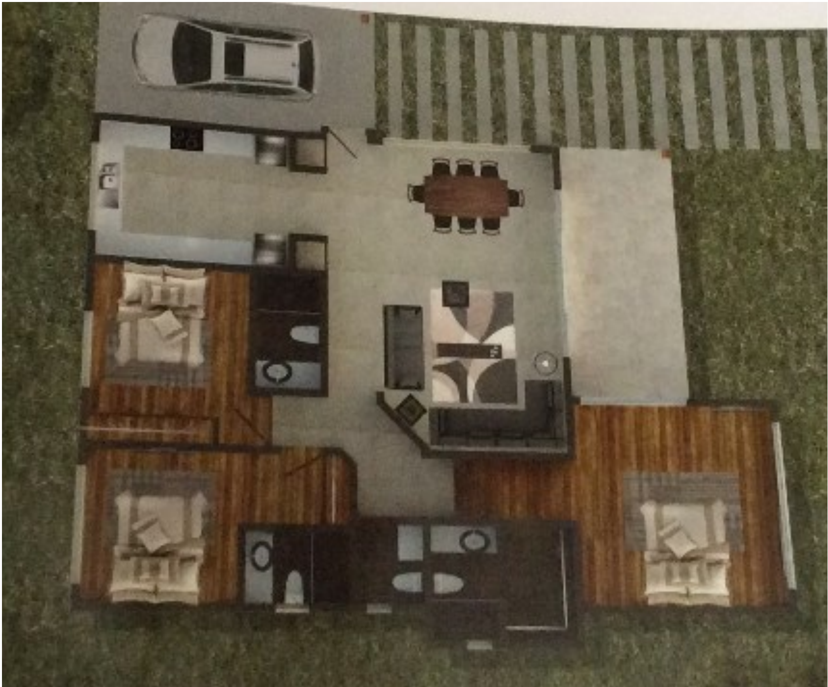
3 Bedrooms / 3.5 Baths