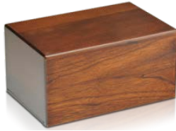
Basic Catalpa Wood Urn 8.5" x 6.5" x 4.5" 200 cubic inches $ 85.00