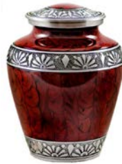
Espresso Brown Alloy Urn 9" x 6.9" 200 cubic inches $345.00