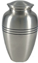
Brushed Pewter Urn 10.5" x 6" x 6" 200 cubic inches $ 285.00