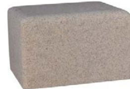
Sierra White Cultured Stone Urn 7" x 5.5" x 8.5" 210 cubic inches $ 245.00