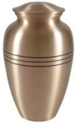
Traditional Bronze Urn 10.5" x 6" x 6" 200 cubic inches $ 285.00