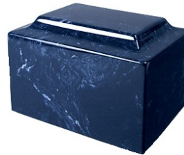
Kenzy Cultured Marble Urn 9.75" x 6.75" x 6.5" 200 cubic inches $ 360.00