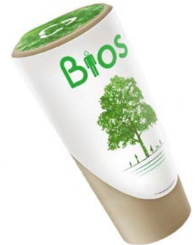
Bios Urn Biodegradable Allows for proper growth of a tree or plant when planted with cremated remains $390.00