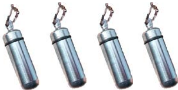
4 Capsule Keepsakes Tubes Brushed Silver Approx 1" $100.00