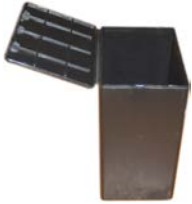
Basic Plastic Container 8.25" x 6.5" x 4.5" 200 cubic inches $ Included