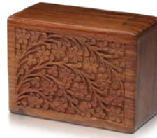
Rosewood Hand Carved Urn 5" x 9.5" x 6.5" 218 cubic inches $145.00