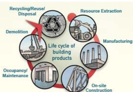
Diagram of the Life Cycle Assessment process for building products.

In the first of this series of three articles, I provided a basic overview of what Life Cycle Assessment (LCA) is and what it entails. This second article focuses on common misconceptions and misunderstanding about LCA by addressing typical criticisms of the method. Limited understanding poses a continuing problem, not only for LCA practitioners and entities promoting LCA, but also for code developers, policy makers and other users of the results of studies.