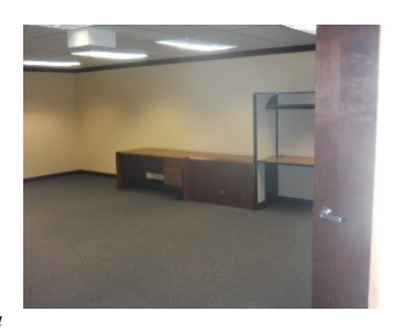
Though obtained from a