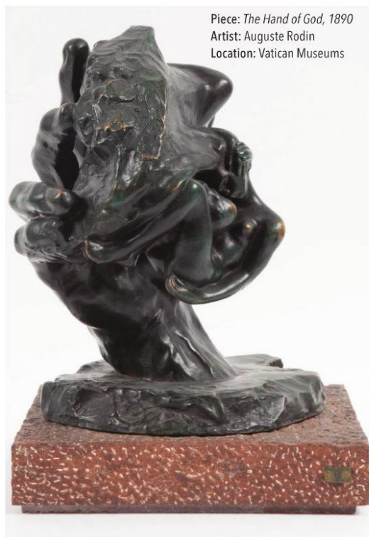
Piece: The Hand of God , 1890 Artist: Auguste Rodin Location: Vatican Museums

The Old Testament offers amazing tips on the