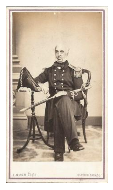
A British Veteran Of the 1812 War

in the War of 1812, learns of Bacon's plan and responds by sending local boats to surround the Creole in port.