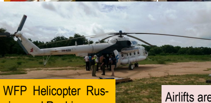
WFP Helicopter Russian and Rushing...