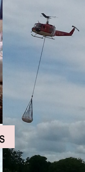
Airlifts are continual to inaccessible areas