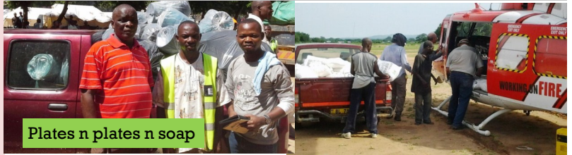
Plates n plates n soap