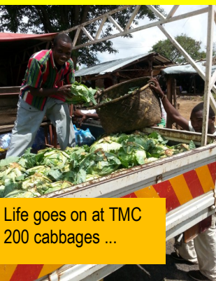
Life goes on at TMC 200 cabbages ...