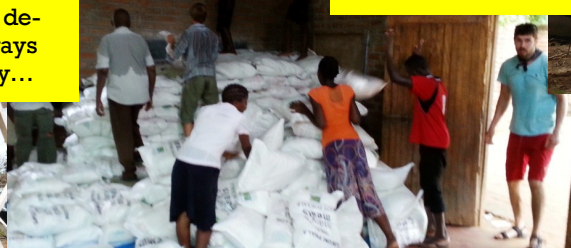
Dining hall losing out to storage of Likuniphala ...we have taken over a standard 1 classroom as well as their school day ends at noon...