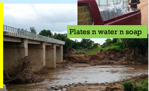
Plates n water n soap

Some say WWJD? Some say Oh Lord! We say Help Lord! Help us to hear you and know you and then do! Awesome God, order our steps, we bow down in adoration Jesus!!! Our Father the great I Am not the I was or will be. Thank you Holy Spirit.