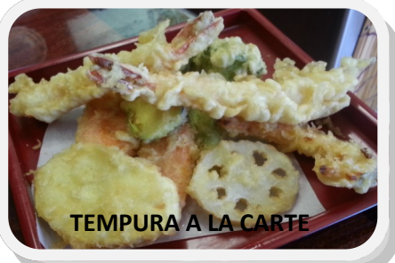
TEMPURA A LA CARTE