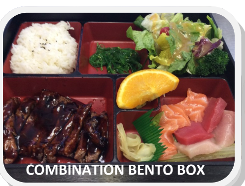
COMBINATION BENTO BOX